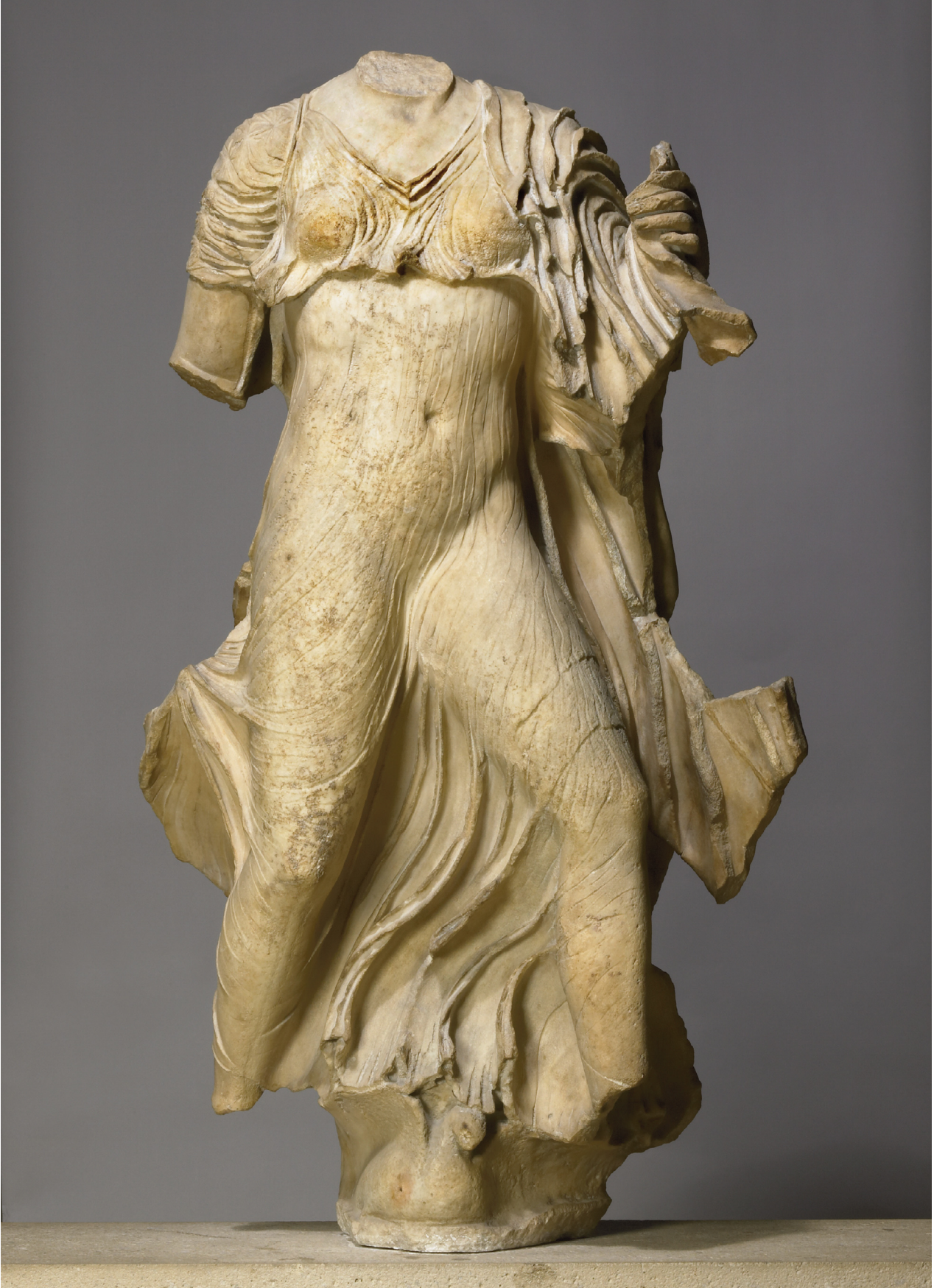
Figure 3. One of the so-called 'Nereids' from the Nereid Monument, marble, height: 1.37m, ca 390–380 BCE, Xanthus, Lycia. London: British Museum inv. 1848,1020.81.