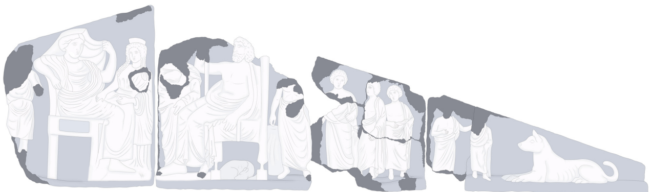
Figure 7. Drawing of the east pediment from the Nereid Monument (by M. Grimaldi. Rights belong to the author).