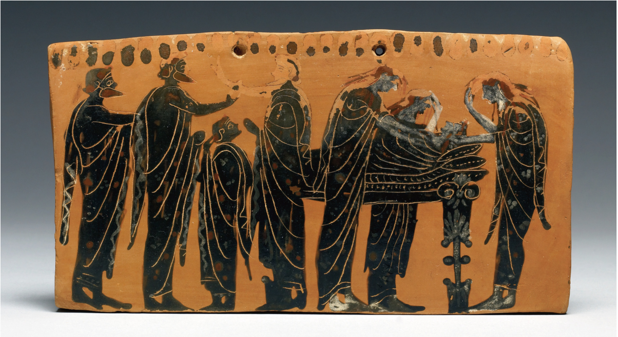
Figure 15. Black-figure pinax with funerary scene, attributed to the Gela Painter. Second half of the sixth century BCE, Attica. Terracotta. 9 x 16.8cm. The Walters Art Museum, Baltimore inv. 48.225 (Reproduced with permissions from The Walters Art Museum).