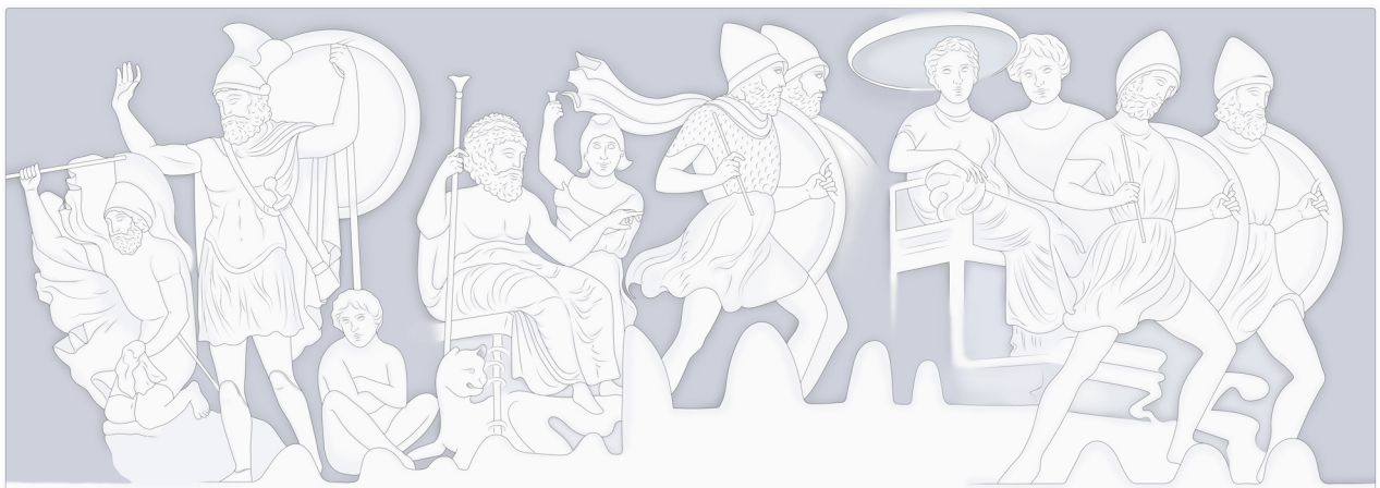
Figure 12. Drawing of dynastic couple from the west wall of the heroon of Gölbası-Trysa (by M. Grimaldi. Rights belong with the author).