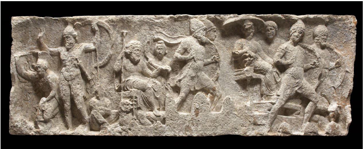
Figure 11. Detail of the dynastic couple from the west wall of the heroon of Gölbası-Trysa, ca 370. Vienna: Kunsthistorisches Museum, I 462.

donian bear hunt – with historicising, documentary friezes (Benndorf, Niemann 1889; Childs 1978: 13–14; Oberleitner 1990; 1994; Landskron 2016). The specific iconography that concerns me here can be found on the west wall: to the right of a scene in which warriors perform ritual animal sacrifices is a peculiar image of an enthroned dynastic couple and their two servants, and all four of these figures are depicted among or alongside armed soldiers running into battle (Figs 11–12). In the foreground of the relief, Lycian merlons emerge from the bottom edge of the panel, thus suggesting that the scene takes place behind city walls. The dynast is bearded and diademed, with a himation covering the lower half of his otherwise nude body. Holding a sceptre with one hand, he sits on an elaborately decorated throne with his feet on a footstool, and he is accompanied by a domesticated but fierce animal.