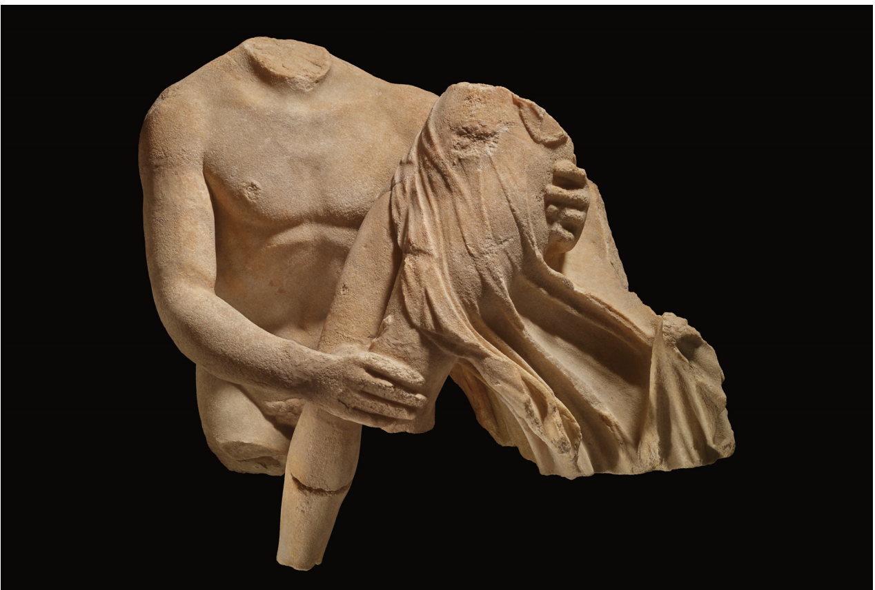
Figure 16. Acroterion from the Nereid Monument, marble, height: 87.50cm, ca 390–380 BCE. Xanthus, Lycia. London: British Museum inv. 1848,1020.134 (926).