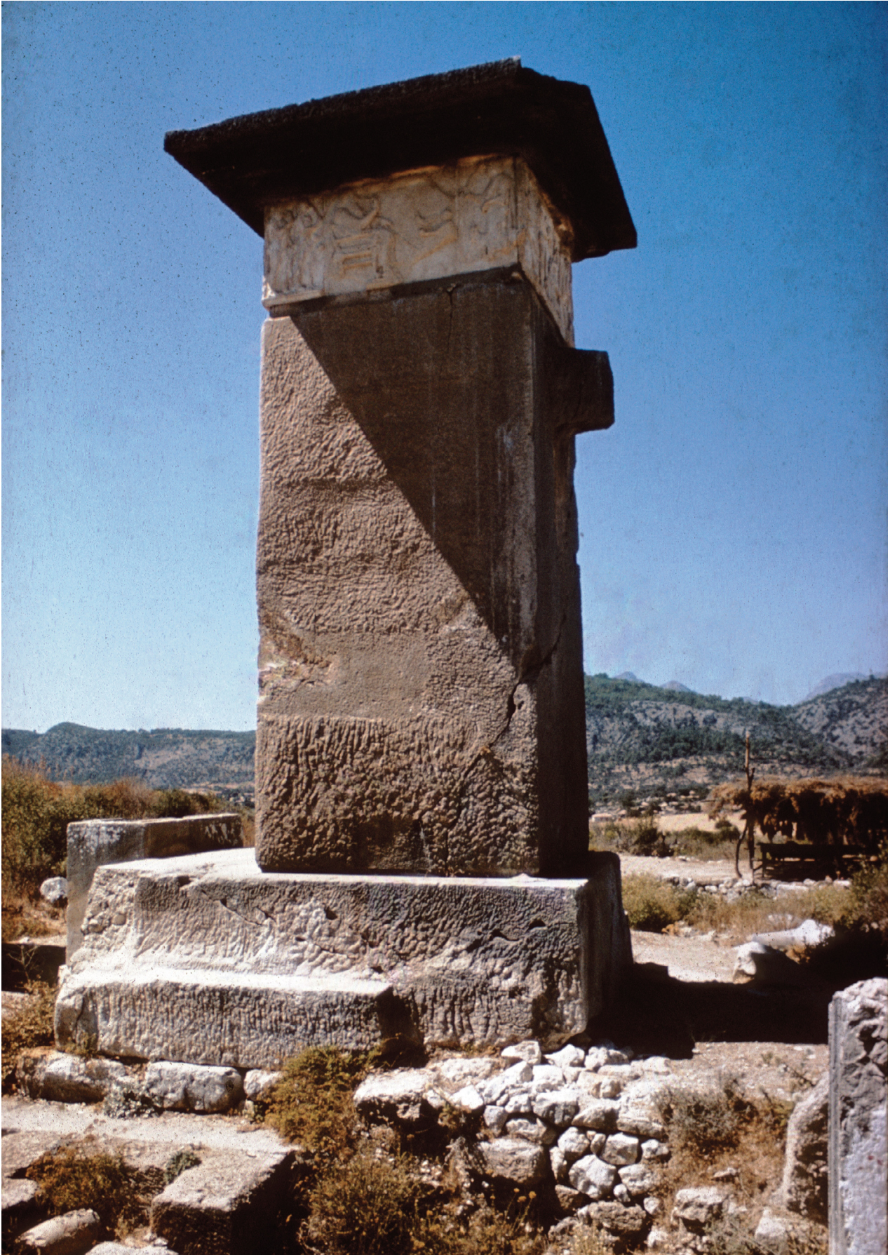
Figure 8. View of the Harpy Tomb in situ, ca 480–470 BCE. Xanthos, Lycia.