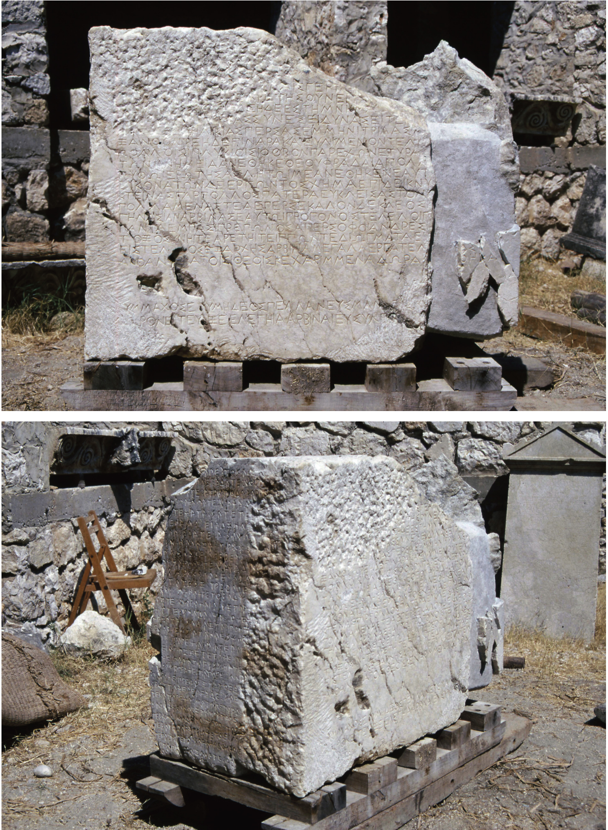
Figure 4. The base of Erbinna dedicated to the Letoon, inv. 6121, after FdX 9: pls 72–73. Top: Face A, with Greek epigram by poet Symmachos; bottom: Wide side, Face A and narrow side, Face D, inscribed with Lycian (Source: Mission archéologique française de Xanthos-Létôon. Reproduced with permission from J. des Courtils).