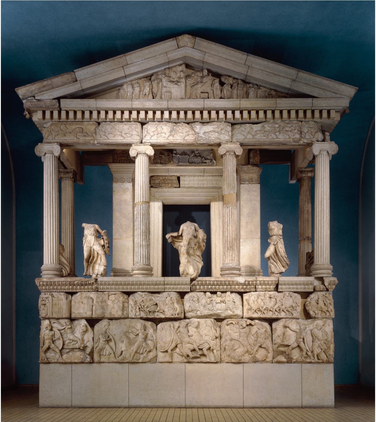
Figure 1. The Nereid Monument, or the funerary and triumphal monument of the dynast Erbbina, on display in the British Museum. Marble and limestone, ca. 390–380 BCE. Xanthos, Lycia. London: British Museum inv. 1848, 1020.81.

and marble, the monument resembles an Ionic tetrastyle, peripteral temple ( templon ), mounted on top of a high podium (approximately 6.8 x 10.17m, on the eastern and northern sides, respectively), with doors on the eastern and western sides of the tomb (see FdX 3: 31–41 for discussion of dimensions of the podium facades). Unfortunately, the original excavators did not record the precise find spots of