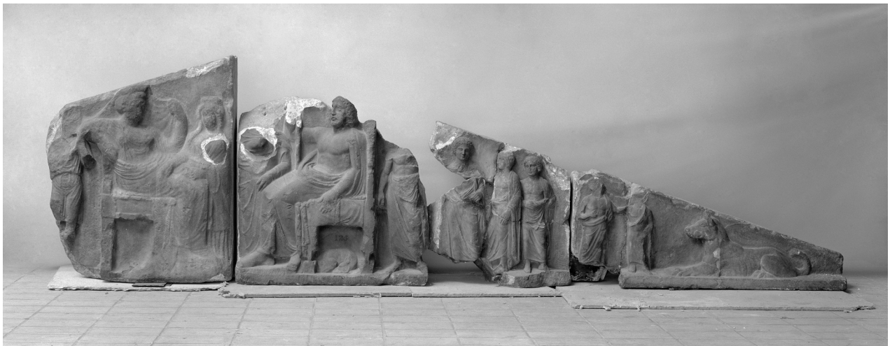
Figure 6. Detail of the east pediment from the Nereid Monument, marble, height: 0.9m, ca 390–380 BCE, Xanthus, Lycia. London: British Museum inv. 1848,1020.125.

In between the dynastic couple stand two smaller female figures wearing chitons: the figure to the right rests one of her arms on Erbbina’s lap, while the figure to the left places both of her arms on the consort’s lap. Standing on either side of the couple are more male and female figures – five behind the consort and six behind Erbbina – who are also smaller in scale compared to the couple. These standing figures are either the couple’s children or attendants, as their diminutive scale may signal their social difference in either relative status and/or age. In the right corner, another sitting dog faces the centre of the pediment. The assembly of various male and female figures on the same horizontal picture plane create an image of a dynastic court or household, and possibly even an entire dynastic family (Ridgway 1997; Jenkins 2006: 199; FdX 8: 216–20).