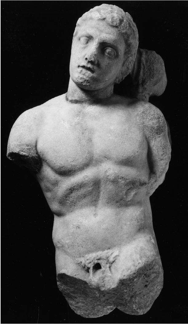
Figure 17. Acroterion from the Nereid Monument, marble, height: 86.36cm, ca 390–380 BCE. Xanthos, Lycia. London: British Museum inv.1848,1020.133 (927).