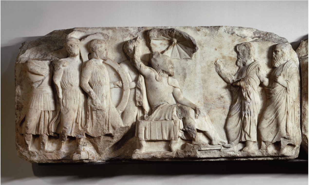
Figure 13. Detail of the enthroned dynast Erbbina receiving an audience from the upper podium frieze of the Nereid Monument. London: British Museum inv. 1848,1020.62.