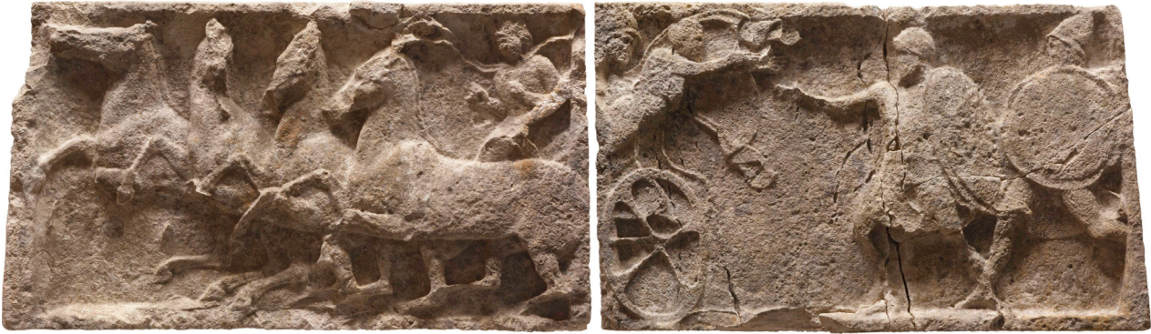
Figure 18. Detail of the abduction/rape of the Leucippides by the Dioscuri, interior north wall of the heroon from Gjolbasi-Trysa, marble, ca 370. Vienna: Kunsthistorisches Museum, I 534 and 535.

Cohen's argument is of particular importance to the Nereid Monument's upper frieze and the ways its visual programme appeals to cultural attitudes regarding the relationship between war, sexuality and gender within Lycian contexts. I reiterate here that the frieze does not present us with an abduction scene, nor do I claim that the woman signifies the 'rape of the Lycian city', as a Naglerian reading might propose. Instead, through the specificity of her pose – which emphasises her lack or loss of status, the sense of heightened trauma while under siege and the state of mourning that emerges from death – the woman portends the victory of Erbbina's troops while anticipating what might happen in the aftermath of war: she too might eventually fall prey to sexual and physical assault. However disturbing or troubling such depictions might be to our own contemporary sensibilities, such visual allusions to grief and abduction not only amplified the violence of war, they likewise appealed to the heroic manhood of Erbbina and his soldiers as brave warriors. Statements of heroic masculinity abound throughout the Nereid Monument's sculptural programme, including scenes of sacrifice and hunt, of male banqueting, of Erbbina receiving audiences underneath a parasol and, finally, of mythological abductions. All such activities and iconographies functioned as a statement of male heroics.