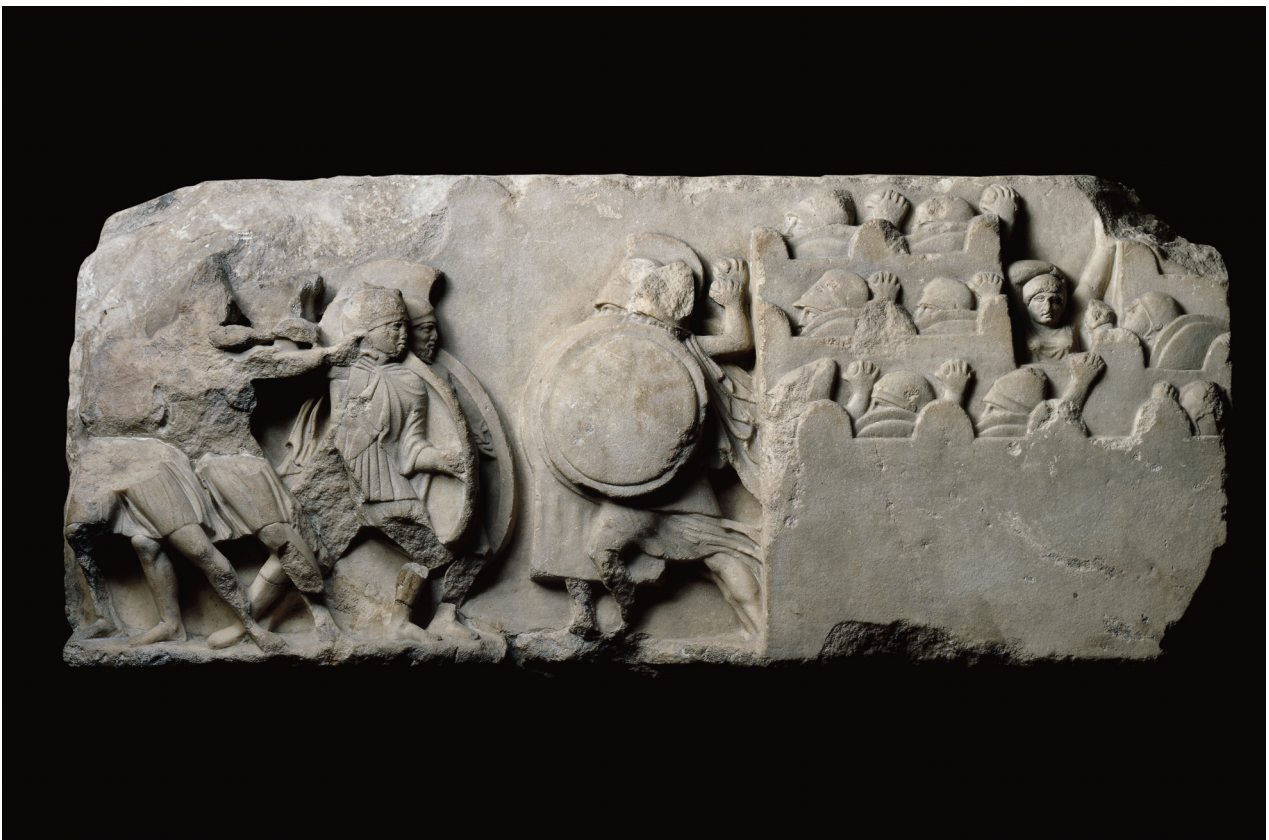
Figure 14. Detail from the city-siege reliefs of the upper podium frieze from the Nereid Monument, marble, length: 1.42m, ca 390–380 BCE. Xanthus, Lycia. London: British Museum inv 1848,1020.65 (869).