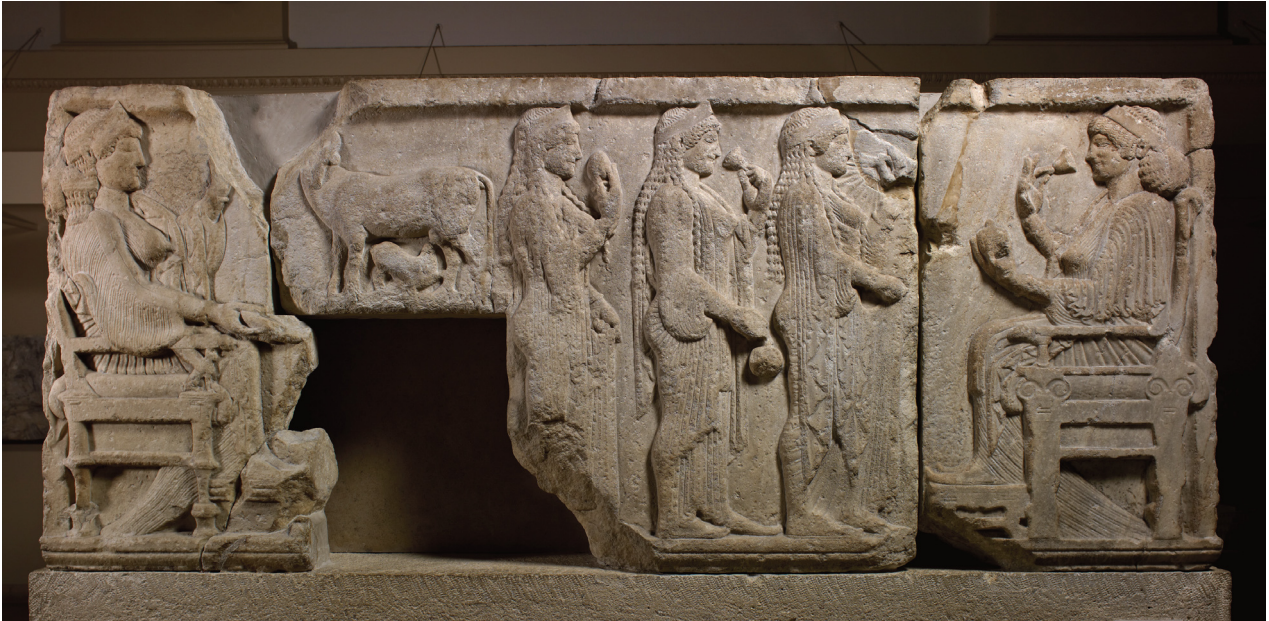
Figure 9. West panel of the Harpy Tomb with female figures, marble, ca 480–470. Xanthos, Lycia. London: British Museum inv. 1848,1020.1.

dynastic figures on the Harpy Tomb who are spatially separated. Finally, the sculptural programme of the Nereid Monument (as well as the Harpy Monument) was perpetually visible to broader audiences long after the dynasts were interred. Thus, the Nereid Monument, as well as other tombs from Lycia, must be studied for their role as public monuments, and, in particular, as public dynastic monuments that may have had varying effects on their viewing audiences; the remainder of this subsection will deal with this first point, and the next subsection will address the last two points.