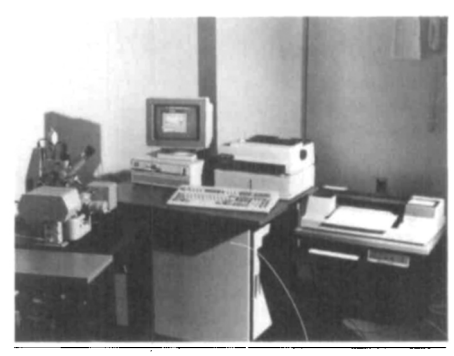
Spreading Resistance System

Hemispherical Electron Energy Analyzer: High-performance analyzer provides ion and electron energy analysis in the 0-5 kV energy range and is specifically designed for mounting to existing UHV chambers. A sophisticated lens enables high sensitivity and resolution by means of a variable (1:100) retard ratio. Applications include XPS, Mono XPS, AES, UPS, ISS, EELS, and PES. Microscience, Inc., 41 Accord Park Drive, Norwell, MA 02061; (617) 871-0308.