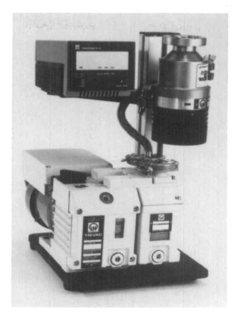
Turbomolecular Components Pumping System