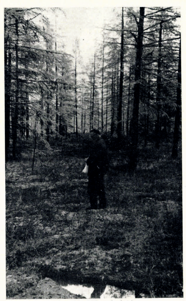
Fig. 5. Humid frozen larch taiga