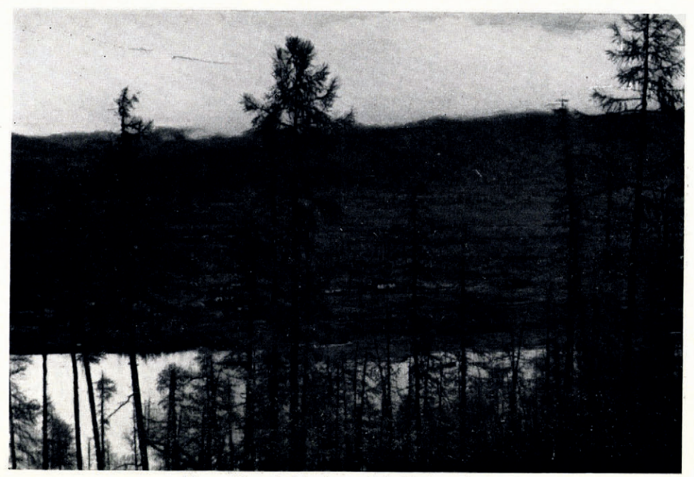
Fig. 2. The typical landscape of the Siberian pole of cold