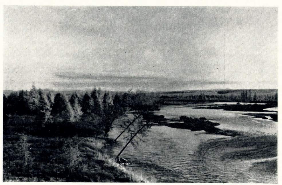
Fig. 3. A typical valley of the Siberian pole of cold