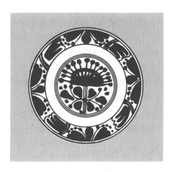
120 pp., $11.50 paper

50 Van Buren Ave., Westwood, N.J. 07675 (201) 664-7070 • Telex 134-474