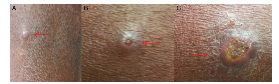
Fig. 1. Skin lesions observed in cutaneous leishmaniasis patients. (a) papule; (b) scaling nodule; (c) ulcer.