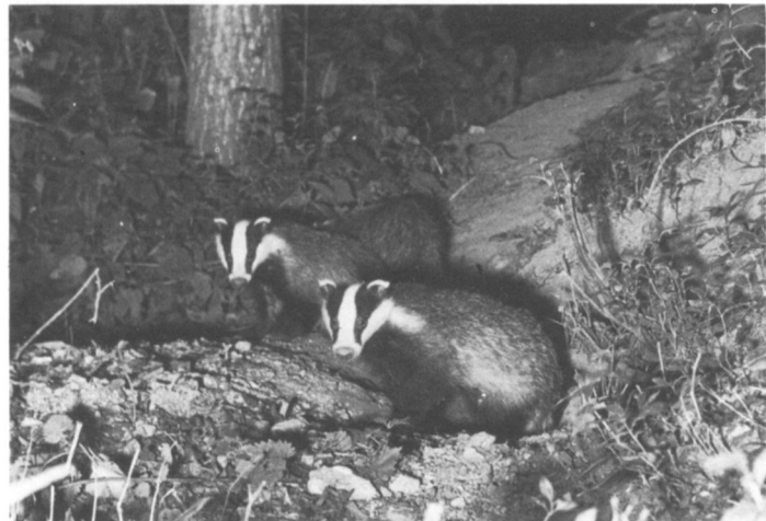
Badgers are blamed for spreading tuberculosis to cattle (Ernest Neal, Wildlife Link).