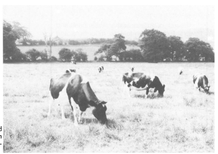
In the 'problem' areas of south-west England less than 0.1 per cent of cattle are infected with tuberculosis, and few of these become infectious (Craig Johnson, Wildlife Link).