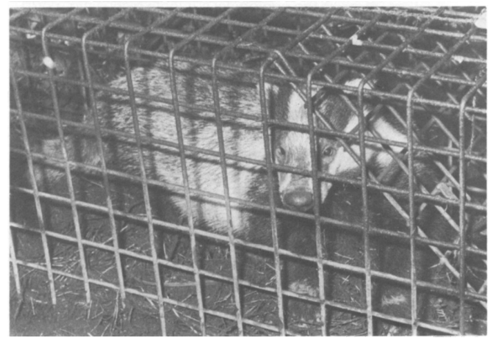
Badger in a cage-trap (Adrian Langdon).