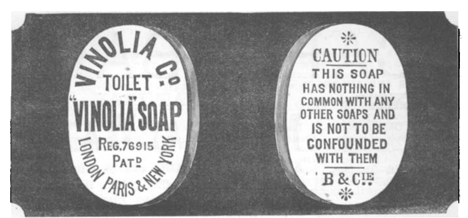
Floral, 6d.; Balsamic, 8d.; Toilet, 10d.; Vestal, 2s. 6d. per Tablet; Shaving Soap, 1s., 1s. 6d., and 2s. 6d. per Stick; Flat Cakes, 2s.

"'Vinolia' Soap is of unquestionable excellence, and much in favour with the profession."— British Medical Journal.