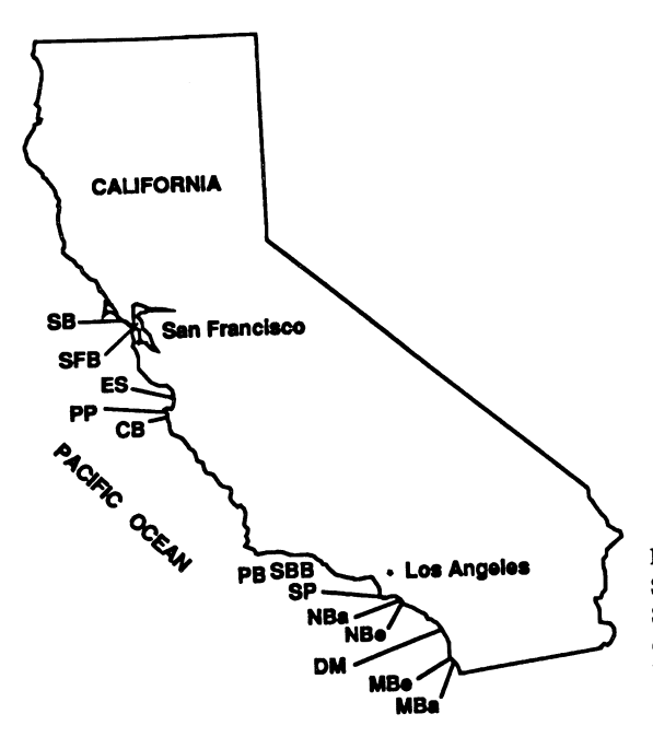
Fig. 1. California sampling locations for this study: SB = Stinson Beach; SFB = San Francisco Bay; ES = Elkhorn Slough; PP = Point Pinos; CB = Carmel Bay; PB = Pelican Bay; SBB = Santa Barbara Basin; SP = San Pedro; NBa = Newport Bay; NBe = Newport Beach; DM = Del Mar; MBe = Mission Beach; MBa = Mission Bay.

In addition to historically collected material, we separated these same mollusk species from estuarine sediments cored in San Francisco Bay. Mollusks from the same stratigraphic level in the core were <sup>14</sup>C-dated to determine differences in apparent ages between species that might be useful in assessing various processes leading to interspecies differences. This information is also useful in illustrating the range in <sup>14</sup>C ages obtainable from the same stratigraphic level in geological sediments using different carbonate shell material.