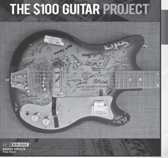
$100 GUITAR PROJECT 69 new compositions • 65 guitarists BRIDGE 9381A/B (2 discs)