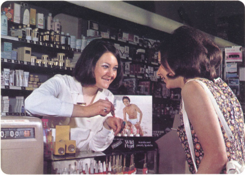
Figure 2. Shop assistant demonstrating a lipstick sample to a customer at a chemist in Runcorn. 'Work in Runcorn' brochure, n.d., Chester, Cheshire Archives and Local Studies (CALs), NTW/65/13. Reproduced with kind permission of Cheshire Archives and Local Studies.