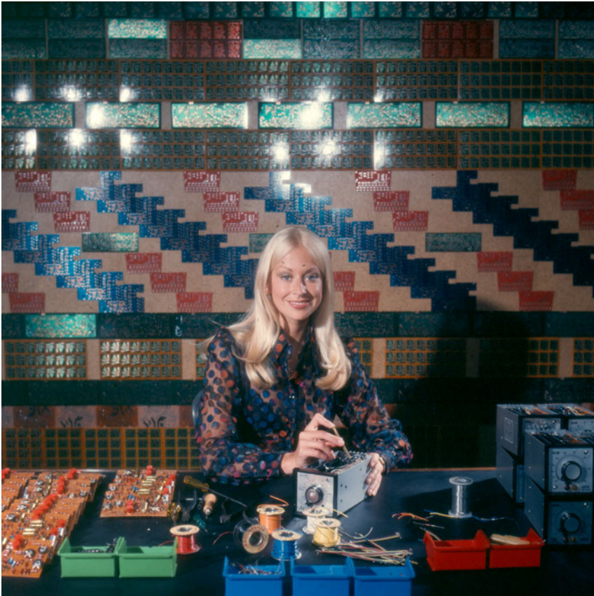
Figure 1. Woman working at the Delta Printed Circuits factory in Skelmersdale. 'Industry – Gillibrands – Delta Painted [sic] Circuits Ltd (int)', n.d., Preston, Lancashire Archives (LA), NTSK/27/1/79.