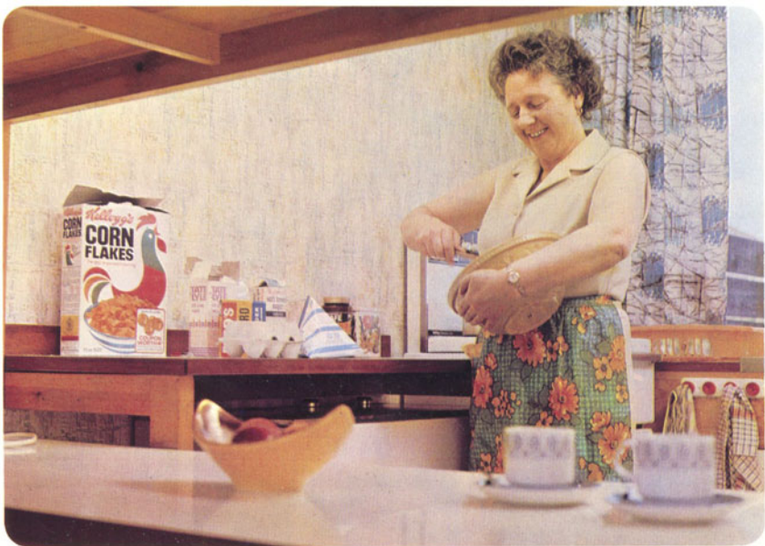
Figure 3. Woman stirring a mixing bowl in a kitchen in Runcorn. 'Work in Runcorn' brochure, n.d., CALs, NTW 65/13.