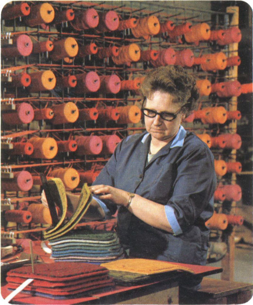
Figure 4. Woman looking at fabric samples in a textiles factory in Runcorn. 'Work in Runcorn' brochure, n.d., CALS, NTW/65/13.

juxtaposed her practical overalls with her feminine blouse and skirt, the spools of thread and fabric samples with the branded food and mixing bowl, and production with consumption. 'Mary finds housework easy in her beautiful new home with its well-equipped kitchen and labour-saving gadgets', the caption explained, 'she has plenty of time for her job in this modern factory, only just over a mile from her home'. The brochure implied that women's paid work was an extension of unpaid housework, enabled by well-planned housing and factories. It also emphasized the availability of part-time jobs, which by