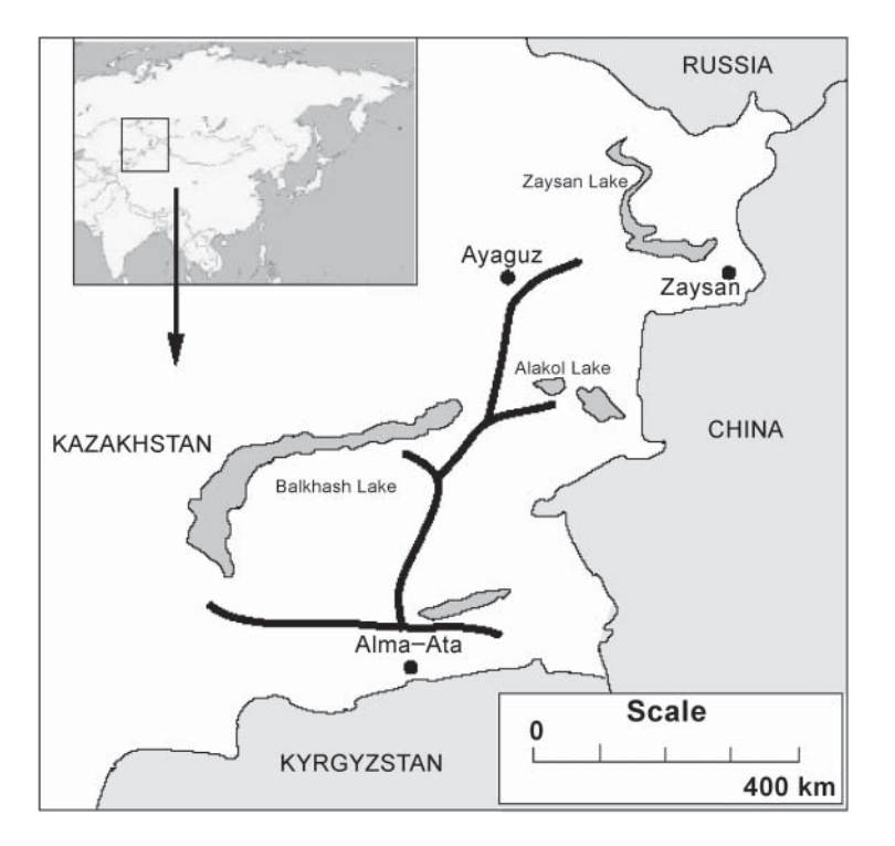
Fig. 1 The study area in south-east Kazakhstan; the solid lines indicate the routes used for the surveys.

areas by agriculture (for further details of the study area, see Sánchez-Zapata et al., 2003). Surveys were carried out during 12-28 June 1999 and 1-16 June 2003 by driving along c. 1,300 km of mostly unpaved roads and tracks (Fig. 1). Most of the cliffs observed within 500 m of the route were carefully inspected to locate breeding raptors; 1-4 hours were spent at each cliff, depending on its size and complexity, with 3-6 experienced researchers walking along the cliff, and observations were also made with telescopes. Breeding was determined by reproductive behaviour and/or the presence of nests with eggs or chicks. We recorded the number of breeding pairs of lesser kestrels as well as of larger raptors that could affect the distribution of the lesser kestrel: saker falcon Falco cherrug, peregrine falcon Falco peregrinus, golden eagle Aquila chrysaetos, steppe eagle Aquila nipalensis, longlegged buzzard Buteo rufinus and eagle owl Bubo bubo. The height of each cliff was placed into one of four categories: (1) up to 5 m, (2) 5-10 m, (3) 10-20 m, and (4) >20 m. The habitat around each cliff was classified into agricultural landscapes (dominated by cereals and irrigated crops, managed pasturelands and human settlements), semi-natural grasslands (with extensive livestock, some abandoned fields and degraded steppe), and natural steppe.