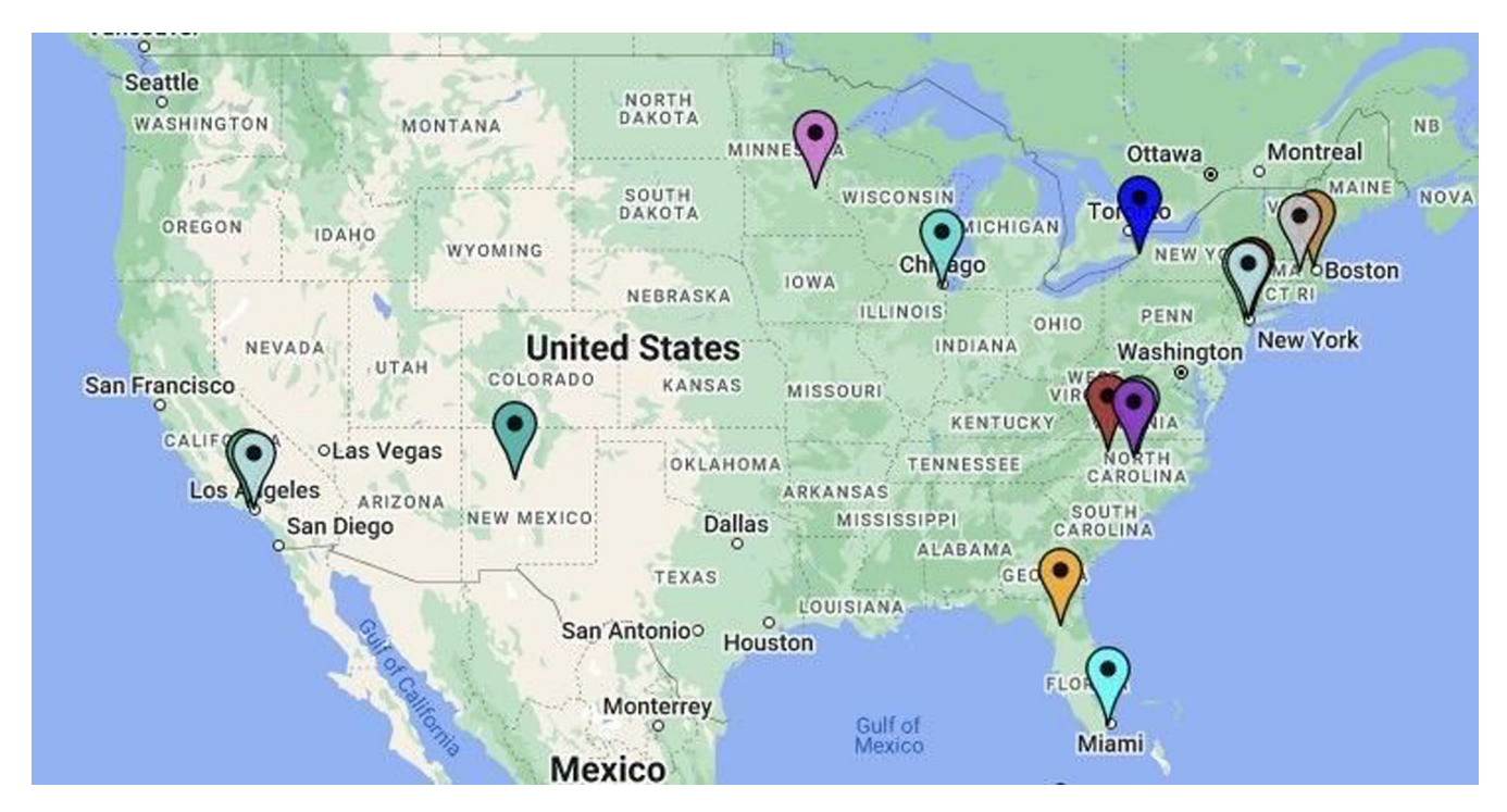
Figure 1. Map of Clinical Translational Science Award hubs.

and engagement of diverse participants in trials, ... one of the first considerations we all always provide consultation on who is the target community you're looking to engage and, have you considered [the] cultural and linguistic context, ... our preliminary consultation, guidance is around ... accessibility of recruitment and outreach materials in terms of language, access, reliability, health literacy. ... we've all also created some guidance documents around community engagement and that process of working with partners. ... we provide those guidance documents to investigators. (HUB 7)