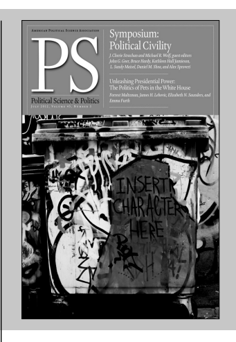
PS: Political Science & Politics is available online at: http://journals.cambridge.org/psc

PS: Political Science & Politics is sold ONLY as part of a joint subscription with American Political Science Review and Perspectives on Politics.