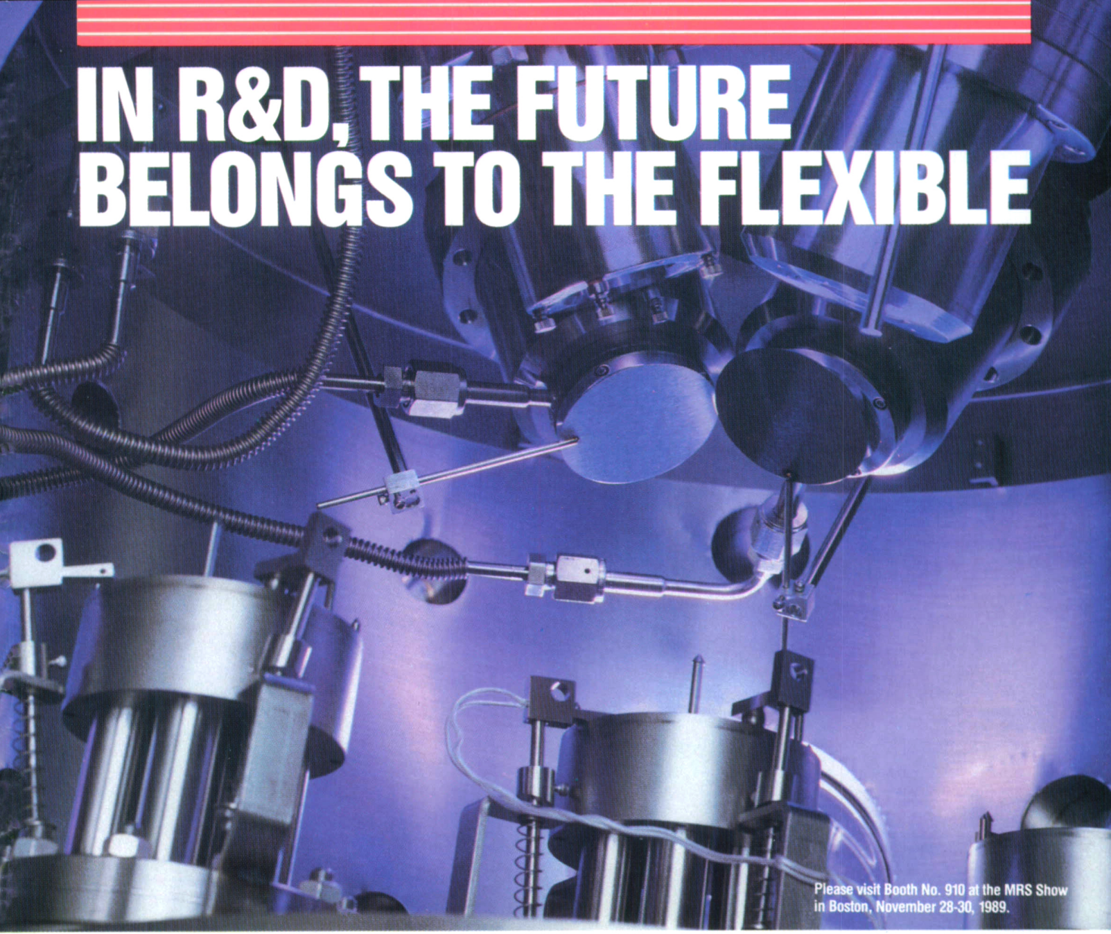
▲ A typical UHV internal arrangement for co-sputtering.

▼ Model 6000 modular UHV deposition system.