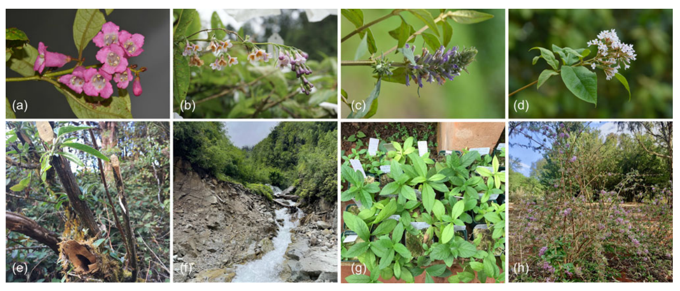
PLATE 1 (a) Buddleja colvilei, (b) Buddleja sessilifolia, (c) Buddleja delavayi, (d) Buddleja yunnanensis, (e) mature B. colvilei cut down in Ilam, Nepal, (f) loss of habitat of B. sessilifolia caused by debris flow and mudslides in the Gaoligong Mountains, Yunnan, China, (g) B. sessilifolia plantlets in Kunming Botanical Garden, and (h) living collection of B. delavayi in Kunming Botanical Garden.

Our study area encompasses the trans-Himalayan region, spanning the eastern Himalayas to south-western China (Fig. 1), including eastern Nepal and western China (Yunnan and Tibet). We first collected species occurrence records from the Flora of China (Li & Leeuwenberg, 1996), Herbarium KUN at the Kunming Institute of Botany, Chinese Academy of Sciences, the Chinese Virtual Herbarium (2023), GBIF (2023) and iPlant (2023). Using the distribution information from these sources we selected 12 locations that together represent almost all known sites of the four species. We conducted field studies over 13 years (2010-2022) to obtain comprehensive data on the four species, following the recommendations for field investigations of Plant Species with Extremely Small Populations (Yang & Sun, 2017; Yang et al., 2020). Our field study did not include the populations of B. colvilei in Bhutan and India, mainly because of geographical barriers and feasibility constraints.