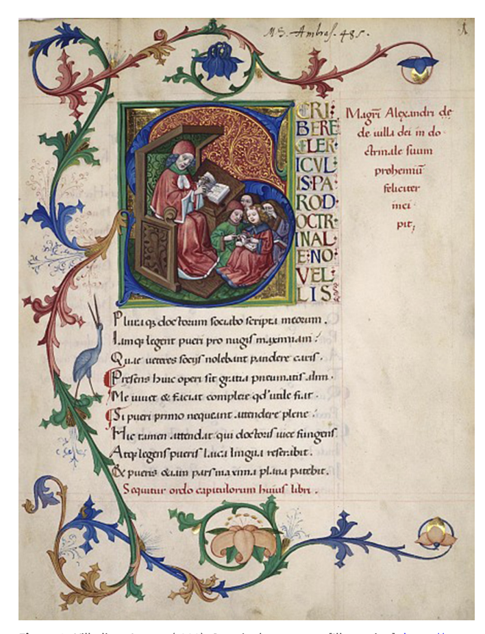
Figure 3. Villedieu, A. von. (1200). Doctrinale puerorum [Illustration]. https://www. habsburger.net/en/media/alexander-von-villedieu-doctrinale-puerorum-pagehistoriated-initial

As Latin has undergone a certain amount of standardisation along with a more global establishment of adolescent education in the last 200 years, one might claim that certain elements of its pedagogy largely omit such dialogical communication. Since Latin had indeed been considered as a 'dead language' due to its relatively small number of fluent speakers and experienced students, the language itself somewhat employed a more sedated, lecture-style