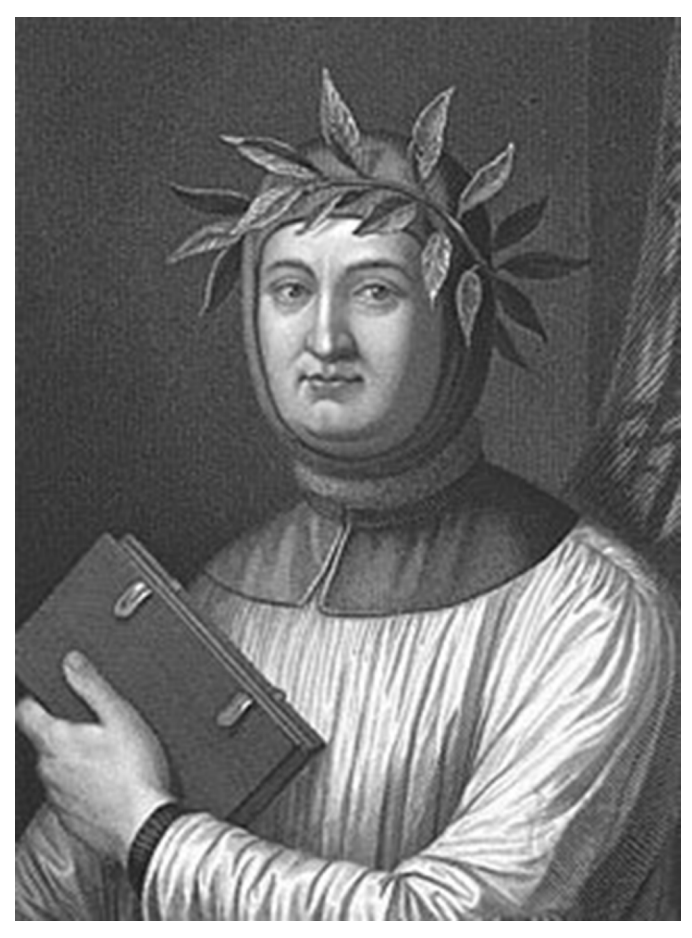
Figure 1. Morghen, R. (n.d.). Petrarch [Illustration]. Encyclopaedia Britannica Online. https://www.britannica.com/biography/Petrarch#/media/1/454103/16662

parts of speech and other grammatical features (Matter, 1990, p. 647). Nonetheless, such personal accomplishments often remained menial to the general scope of the medieval intellectual community, as the majority of institutions continued to rely on memorisation of one-sided explanations of texts till the year of rhetorica even until the 16th century.