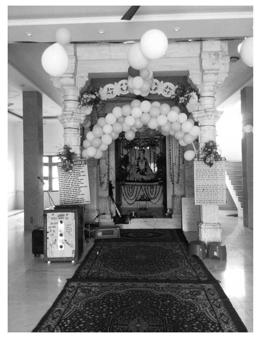
FIGURE 1.2 The new temple of Laldas at Punahana