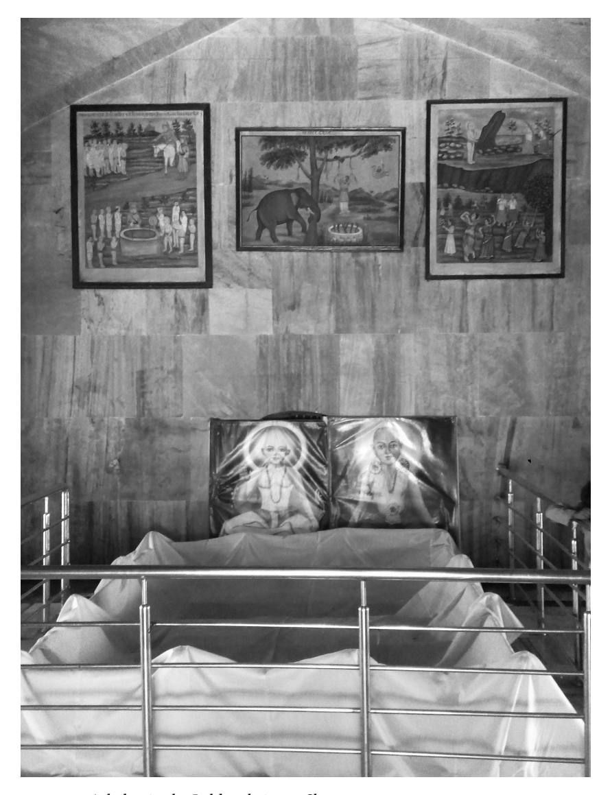
FIGURE 1.3 A kabra in the Laldas shrine at Sherpur

(religious order) shared practices and beliefs.<sup>14</sup> I argue that the rise of shared religiosity around Laldas and the persistence of disputes between the two different types of religious followers indicate historically changing forms of religious cultures in north India in general and Mewat in particular.<sup>15</sup>