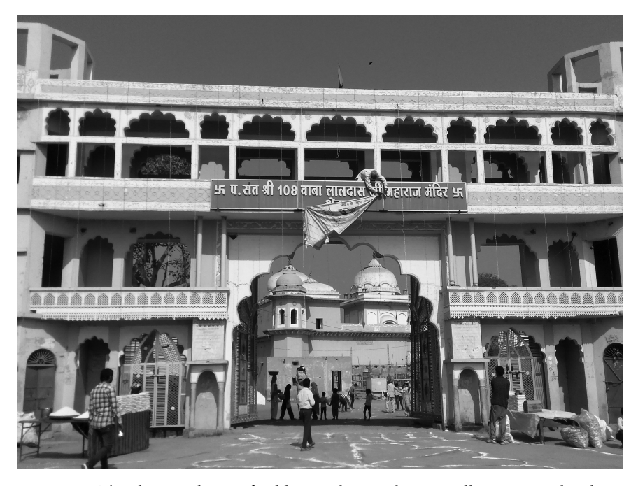
FIGURE 1.1 The Sherpur shrine of Laldas or Khan at Sherpur Village, Ramgarh, Alwar