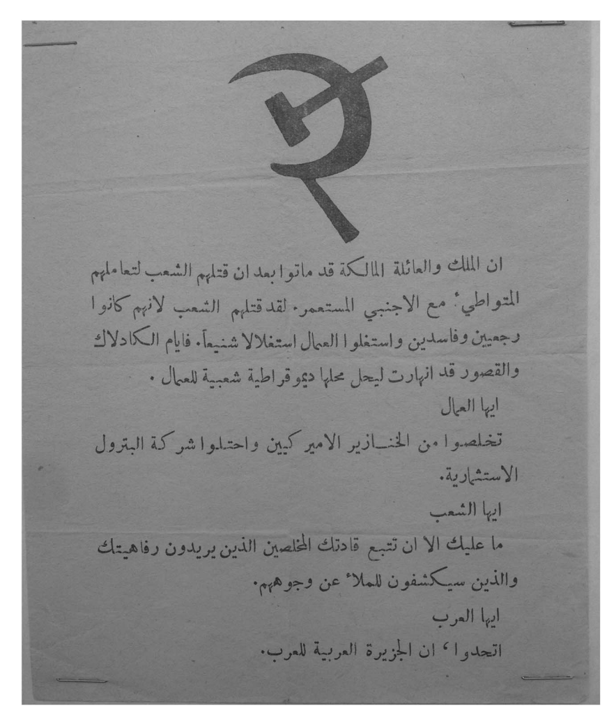
Figure 4. Leaflet distributed in Khobar on 19 and 20 August 1954. National Archives at College Park, Maryland, RB 59, 786A.00/8-3054. <sup>26</sup>

group associated with the library was arrested in 1957, the library reopened, but severe ideological splits started to emerge amongst the activists of Qatif, as a reflection of the divisions in the wider Arab world, between Baathists, Nasserists, Arab nationalists, and communists.