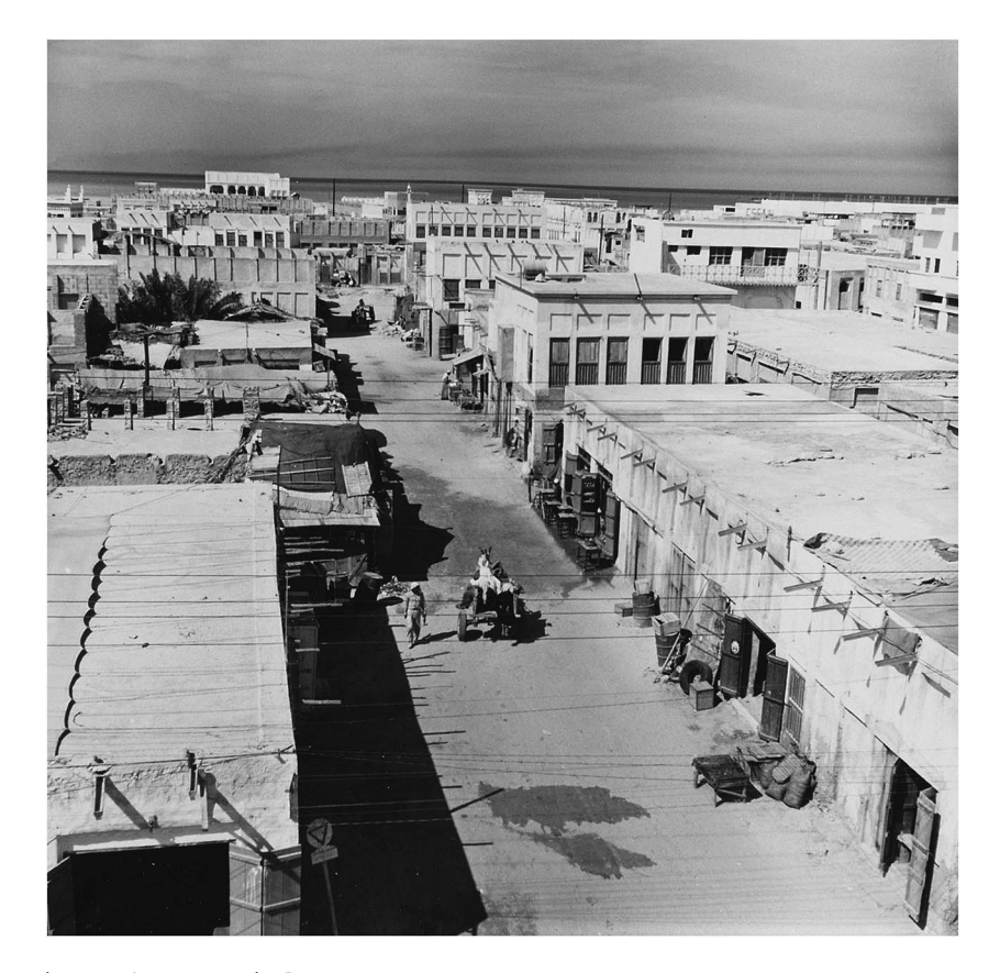
Figure 5. Street scene in Dammam.

In 1953, one of those behind jami'iyyat al-'ilm li-l-nidal wanted to establish a newspaper called al-Jazira (The Island) but was denied permission by the authorities.<sup>33</sup> This was part of a push for a relatively free, albeit short-lived press in the Eastern Province in the mid-1950s that also included Akhbar al-Dhahran (Dhahran News) and the cultural journal al-Ish'a' (The Shining Light), which was published in Khobar from 1955 to 1957.<sup>34</sup> These newspapers were filled with letters and editorials discussing the Arab Nation and community grievances. "The appropriation of Arab nationalism" in these papers increasingly