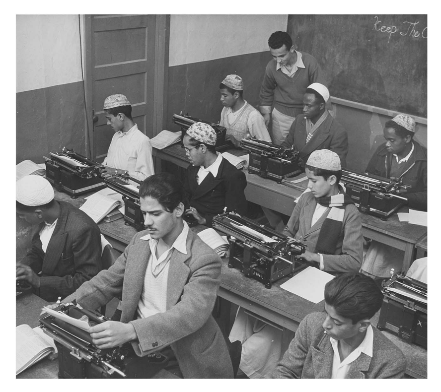
Figure 3. Aramco School in Dhahran, Saudi Arabia.

in left-wing political parties in their countries of origin and discussed radical ideas with their students and started to distribute forbidden political literature. They secretly circulated the magazines of the Lebanese Communist Party, al-Sarkha and al-Nida , amongst students and ARAMCO workers. <sup>16</sup> A local trader in Qatif, who sensed that he could do business with students from ARAMCO schools that were keen to get their hands on the likes of Karl Marx and Friedrich Engels, opened a bookshop in Qatif and started to import the classics of the global left. It was seemingly the only bookshop in the Eastern Province that sold forbidden literature, including much of the communist and Arab left canon, but also Russian novels and plays. Hence, the young, aspiring