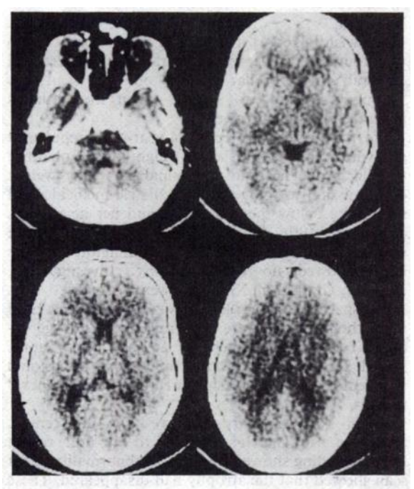
Fig 2.—Repeat CT scan, three months later, showing a normal brain.

EMI scan has become a valuable investigation for excluding space occupying lesions which may masquerade as anorexia nervosa. It is important therefore to be aware of these apparently reversible changes. What causes them and whether they have any bearing on the pathogenesis of anorexia nervosa merit further study.