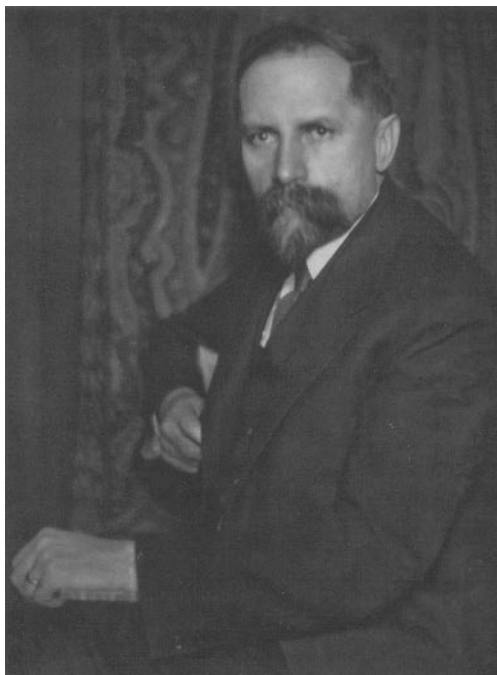
Figure 1: Adolf Meyer.