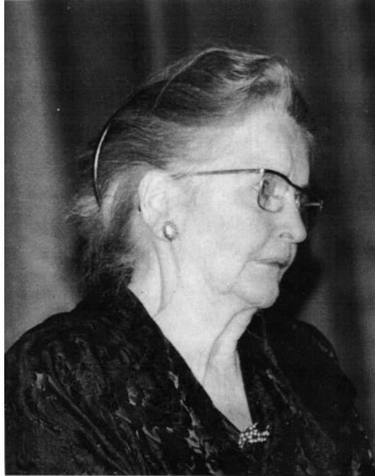
Figure 6: Phyllis Greenacre lecturing during her New York years, most probably during the 1960s.

experimental studies of the psychobiology of laboratory animals—the very antithesis of the intellectual approach his ex-wife was embracing and advancing. Over and over again, he sought ways to take the body apart and put it together again, honing his surgical skills, creating new instruments, constructing novel experiments to examine behavioural and biological adaptation. Even his formal retirement in the late 1950s brought no let-up in his work. To the very end of his life, and to the evident dismay of the university, which found itself unable to eject so distinguished a scientist from his laboratory (even turning off the heat did not dissuade him from remaining in situ ), Richter continued to occupy his space in the Phipps Clinic, turning out papers on growth hormone and cortisol secretion in rats, guinea pigs, and monkeys in his seventh decade on the staff, even as the rest of the building was torn apart and renovated around him.