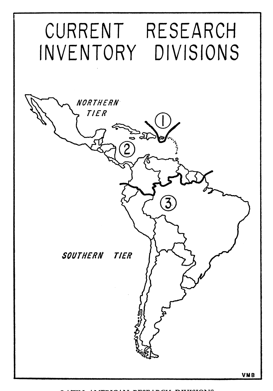
LATIN AMERICAN RESEARCH DIVISIONS

Shaded portion of map designates the area surveyed for research projects for this issue of LARR.