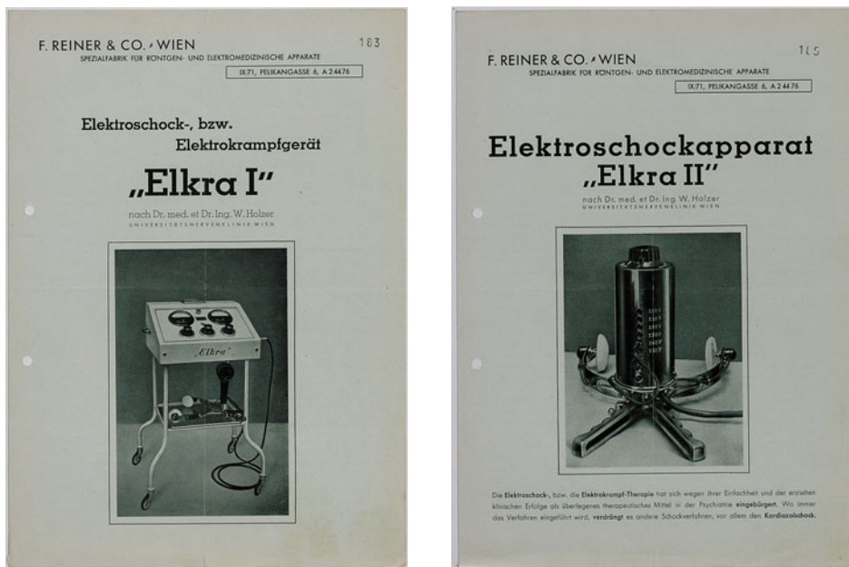
Figure 4: Illustration: Elkra I and Elkra II.