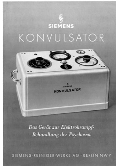
Figure 3: Illustration: Konvulsator.

Policy that had prepared the scientific justification for the Law for the Prevention of Hereditarily Diseased Offspring passed in 1934. 37 The law enabled forced sterilisation in over 400 000 cases of schizophrenia, epilepsy, Huntington's disease, hereditary blindness or deafness, congenital mental deficiency or manic depressive illness until the end of the Third Reich.