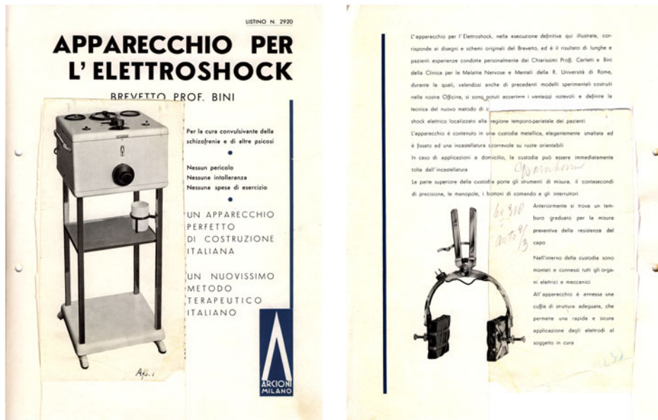
Figure 2: Illustration: Italian manual 'Apparecchio per l'elettroshock – brevetto Prof. Bini', 1939.

Two months after Müller, in French-speaking Switzerland, Oscar Louis Forel (1891–1982) started to administer regular treatments to patients in Prangins at the psychiatric hospital which he had founded. After the first 262 sessions, within eight months, he highly recommended the therapy. 26 Consequently, with Italy's entry into the war, Müller wanted to avoid the possibility that the supply of the devices he required for this very promising therapy might be threatened, and so he gave his Arcioni apparatus to Purtschert & Co. in Luzern for reproduction. 27