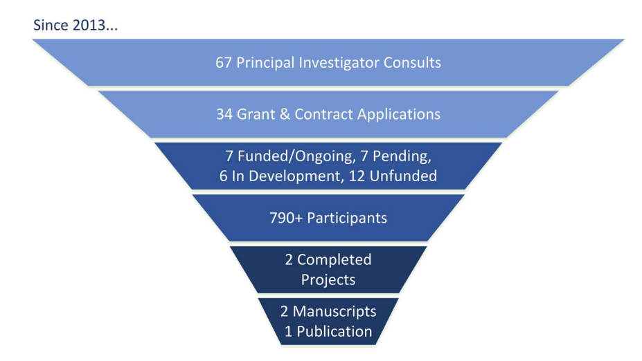
Fig. 2. Summary of the Northwest Participant and Clinical Interactions Network accomplishments.