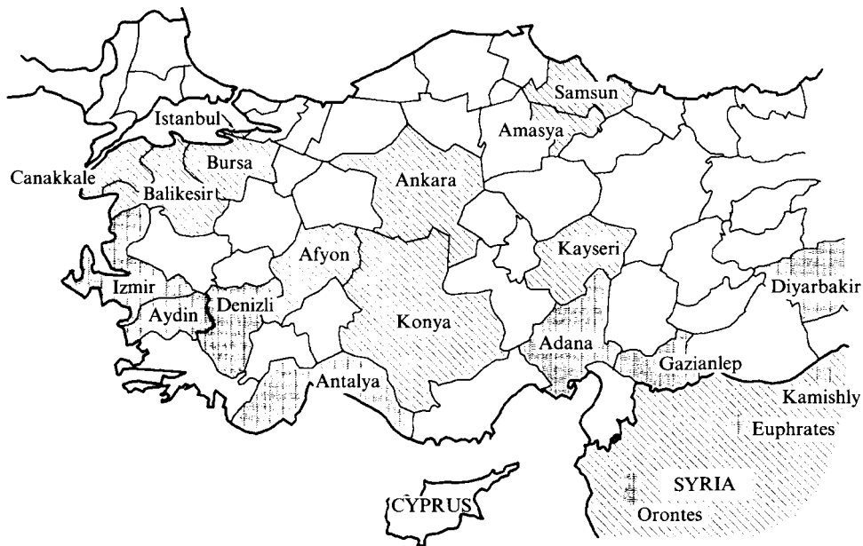
Fig. 1. The distribution of Akabane virus in Turkey and the Middle East in 1979. ■, Serological evidence of Akabane virus activity; □, no evidence of Akabane virus activity.

Alla in July 1979 indicating that cattle on this farm had had earlier exposure to Akabane virus. At the same time 11/21 3-month-old calves were also positive for Akabane antibodies. When calves in this group were re-sampled as yearlings, in January 1980, no positive samples were found. Antibody titres in the adults varied between 160 and 1280 while in the calves, 1 sample had a titre of 1280 and the remaining 10 had titres in the range 80–160. When 2 and 3-month-old calves were sampled in April 1980, only 1 out of 8 samples was positive and when this second group of calves was resampled in early 1981 no positive sera were found. At Wadi Dulail one positive adult serum sample was detected from an old animal bled in 1979 but there was no evidence of infection on this farm in either 1979 or 1980.