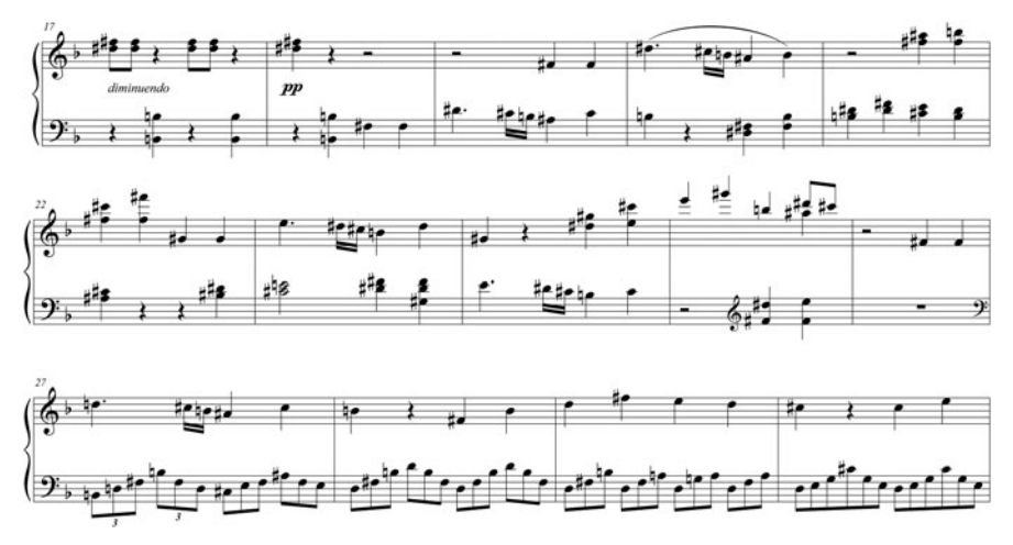
Ex. 4 Beethoven's cadenza to K466, mvt. i, bars 17–30

(bar 17) (in contrast to Brahms) in placing Mozart's theme in B. Schumann, however, went directly for the minor key, whereas Beethoven presented it both in B major (introduced by a dramatic semitone shift in the bass, bars 14–15) and in B minor (bars 26–28) (Ex. 4 in comparison with Ex. 1). Schumann and Brahms take inspiration from both statements and roll their characteristics into one: the theme is subjected to imitative treatment, which is more widely spaced (6 rather than 4 crotchets), but at the same time made more complex by placing it in the right hand only and at the melodic interval of the sixth (rather than at the octave). In the cadenzas by Schumann and Brahms, the left hand is therefore free to harmonize the theme with chordal tremolos. Beethoven reserves this effect for the second, non-imitative presentation of the theme (bars 26ff.), where the arpeggiated chords in triplets (rather than tremolos) help to create a continuous flow in the ensuing modulation.