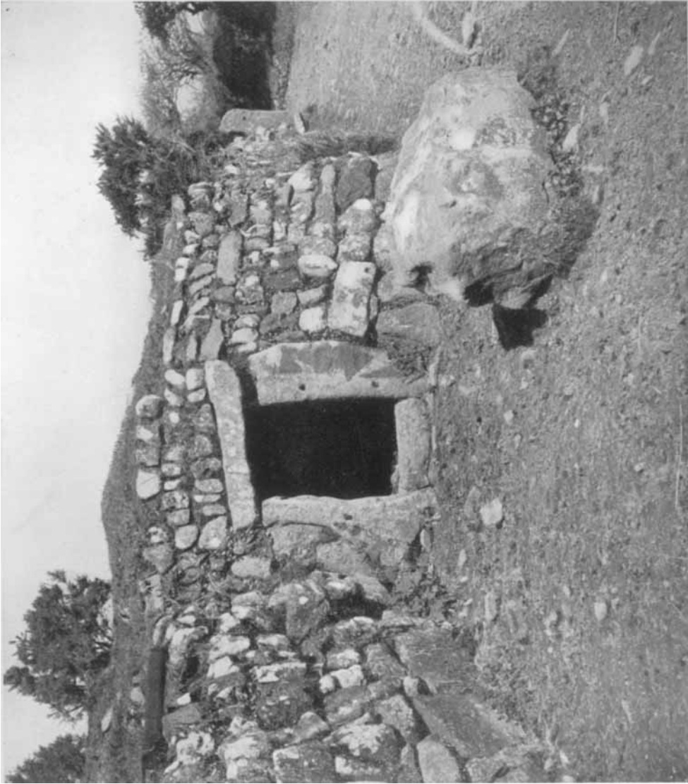
GOOSE-HOUSE AT CARNA-QUIDDEN, CORNWALL