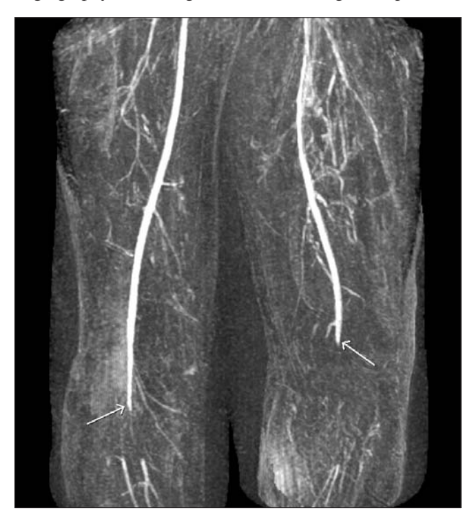
Fig. 1. Arteriogram demonstrating bilateral filling defects in the right popliteal and left superficial femoral arteries consistent with embolic occlusions.

Intra-arterial thrombolysis was attempted, but discontinued after 12 hours because of localized bleeding. Repeat angiography revealed good flow on the right but poor cir-