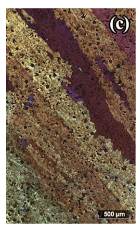
Figure 1 . As-cast structure of steel specimens: a, b, c – specimen \mathbb{N}_2 1, \mathbb{N}_2 2, \mathbb{N}_2 3, tint etched, polarized light, sensitive tint, \times 50