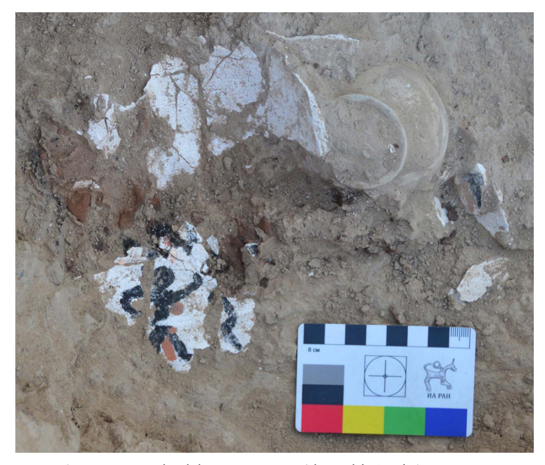
Figure 5. Gonur 20, grave 78, the polychrome painting in situ.

oriented to the north-west. There were five ceramic vessels positioned to the west of the body, including a rare, large round-bottomed vessel decorated with horizontal red stripes. The assemblage included a stone biconical bead, a metal seal and a bronze hairpin decorated with turquoise and lapis lazuli beads and a miniature limestone human foot. The remnants of a wooden item (perhaps a box cover or plaquette), plastered with lime-sand mortar and covered by the polychrome painting, were found in the south-east part of the pit.