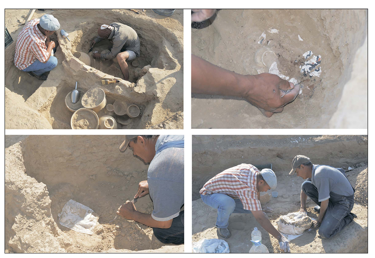
Figure 4. Gonur 20, grave 78, showing the process of the excavation; conservation of the painting fragment was undertaken by Mered Rzakov (Mary History Museum) and Muhametnazar Begliev.