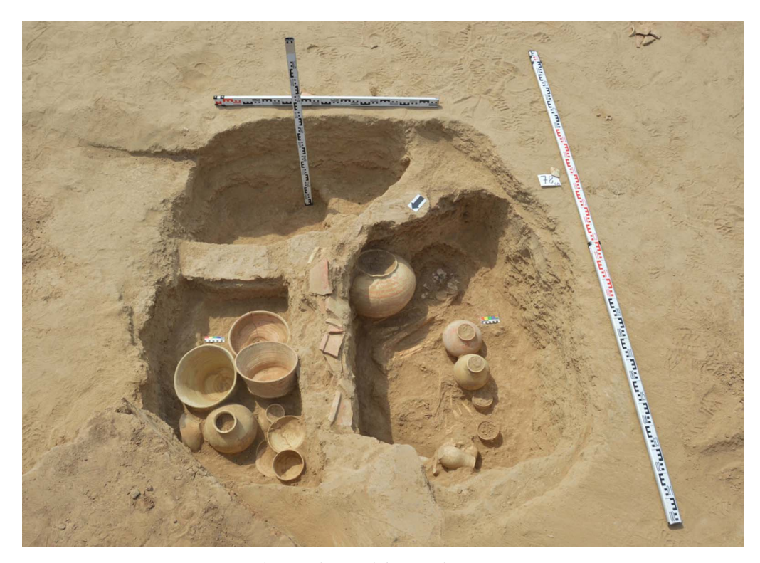
Figure 3. Gonur 20, grave 78, general view.

urban centre. Two of them—Gonur 20 and 21—were first excavated in 2010 and 2011. The excavations revealed that the settlements differ in layout and, possibly, also in specialisation. Gonur 20 comprised ovens, kilns, residential construction, household zones and more than 70 human and animal tombs (cists, shafts and ground pits). One specific trait of the site is the presence of rare fragments of steppe pottery and buildings not typical of a Margiana oasis. Perhaps this is one of the few examples of evidence for interaction between farmers and mobile cattle breeders in south-eastern Turkmenistan (Sarianidi & Dubova 2012).