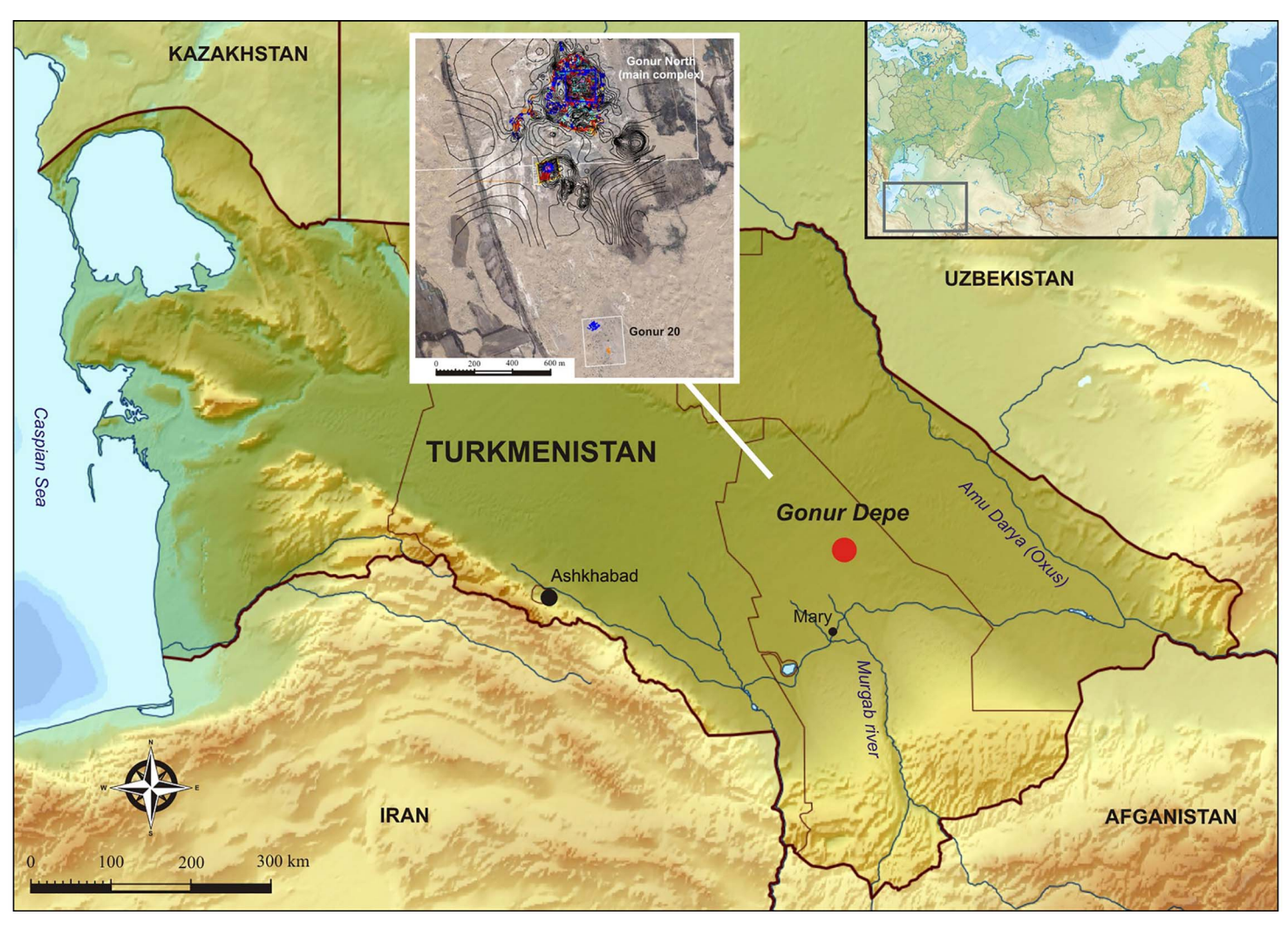
Figure 1. Location of Gonur Depe and Gonur 20.