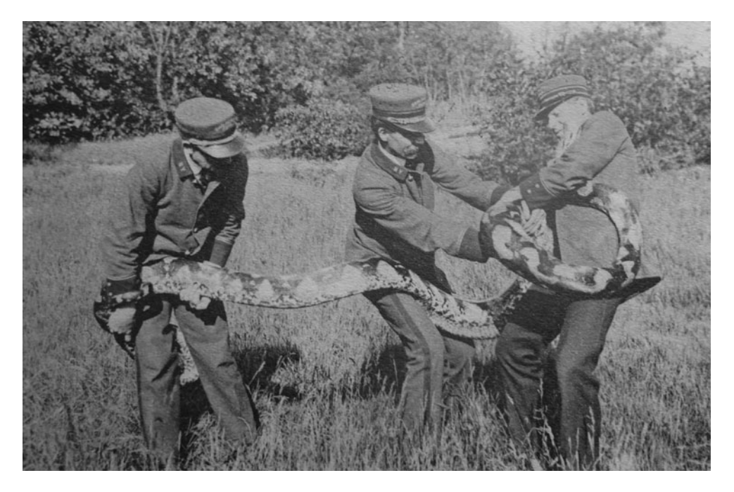
Figure 3. 'Handling a python', New York Zoological Society, postcard, 1906.