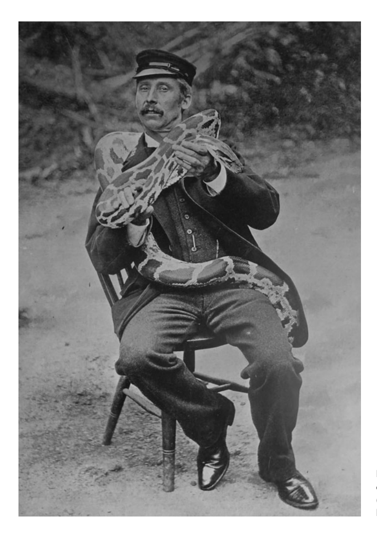
Figure 2. 'A London snake charmer', All about Animals (London: George Newnes Ltd, 1898), p. 138.

the Society's Reptile House is confined to cases in which such diet is a necessity, and in these cases all care is taken to avoid any unnecessary suffering'.<sup>47</sup> Taking this as an admission that live feeding did occur, Salt pushed to have it banned, or at least regulated, suggesting that an officer of the RSPCA be present during feeding times to ensure no gratuitous cruelty took place.<sup>48</sup>