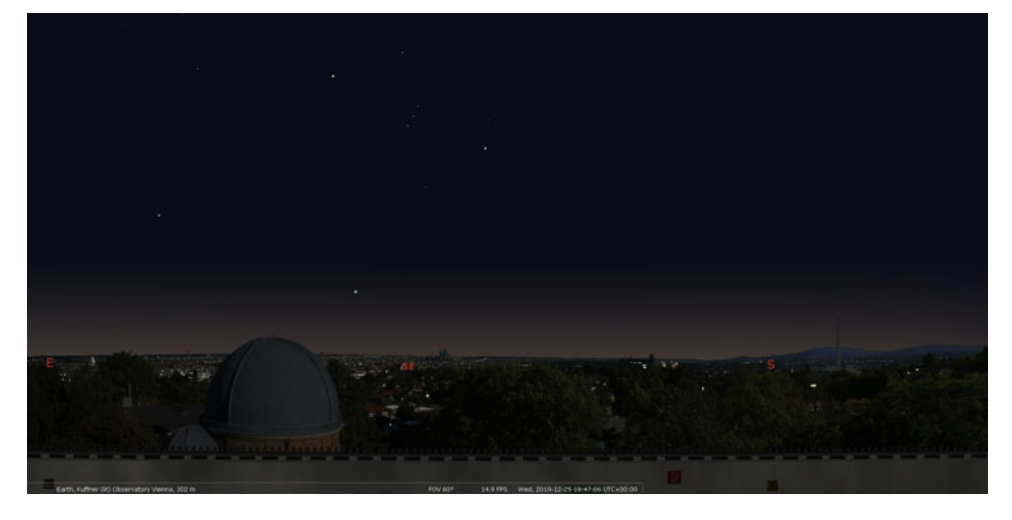
Figure 2. An illustrative simulation of artificial light at night in Stellarium 0.20.4. The landscape panorama from Vienna's historical Kuffner observatory (late 19th century) was created by M. Prokosch and made available on the Stellarium repository of publicly available landscapes. It was modified by the author by adding a simple hand-painted layer of nocturnal illumination: street lights, bright windows and the light glow of the city of Vienna towards the east.

Yeomans & Kiang 1981; Mucke 1985). A week under the pristine skies of Namibia convinced me to implement a visualisation of the Zodiacal light for version 0.13.2 (Kwon et al. 2004).