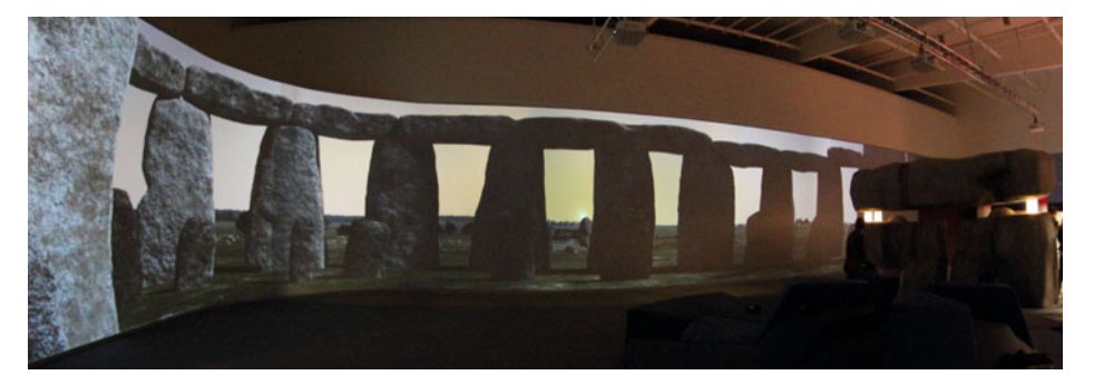
Figure 4. The skyscape planetarium, a 25 \times 4 m screen with 5 overlapping projectors providing the landscape backdrop for the central replica horseshoe of Stonehenge in an archaeological exhibition. The scripting functions of Stellarium were used for the narration in daylight hours, and a human operator could operate the program during special tours.

perspective or stereographic projections found elsewhere, but with several others, and especially cylindrical (or Mercator and Miller variants), proved essential.