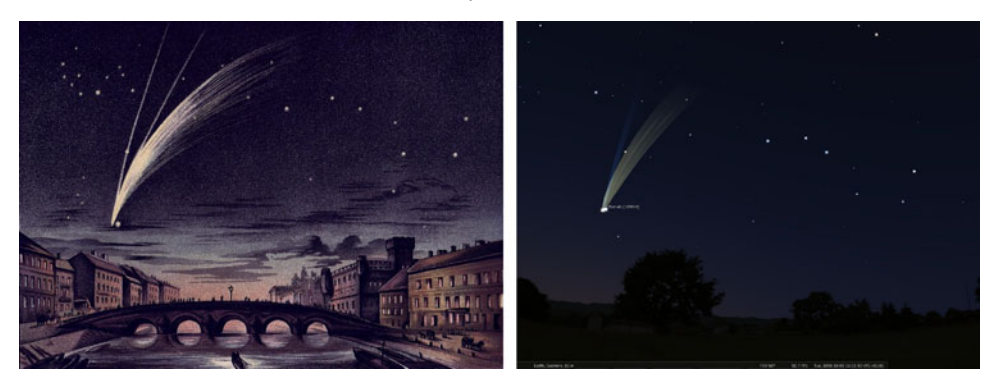
Figure 1. Comet C/1858 L1 Donati (left) in a contemporary illustration (Weiß (1892), Fig. XX) and (right) simulated in Stellarium 0.20.4. Further tweaking could improve the match of tail curvature.

for observation support by creating program extensions (plugins) for simulated ocular and sensor views, and even for driving GOTO telescopes. Stellarium was then based on the Qt4 C++ toolkit, allowing the development of the program with an unconventional user interface which is however easy to operate and works on all three major desktop platforms (MS Windows, Linux/X11, Apple MacOS X). It also allows translation of the program into dozens of user languages, which is performed by several hundred voluntary collaborators utilizing a simple web interface. These factors, and obviously the free availability, have attracted the attention of a large community of users. Currently Stellarium is regularly released around equinoxes and solstices, and each version has seen several hundred thousand downloads.