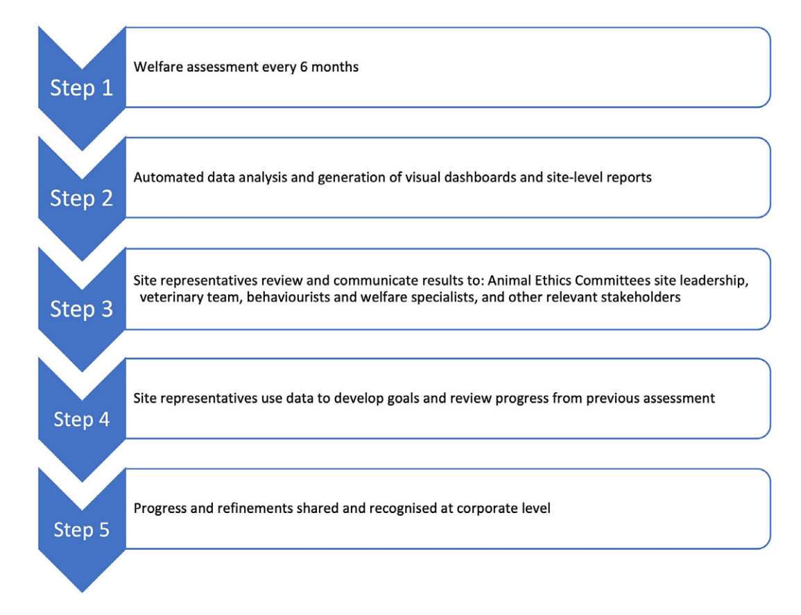
Figure 1. Primate welfare assessment process to be completed semi-annually to track welfare progress over time for facilities working with primates.

English and French version user training guides were created that included a knowledge check (i.e. quiz with five questions) upon completion. The training was presented as an e-learning module and took approximately 10–15 min to complete. Each site