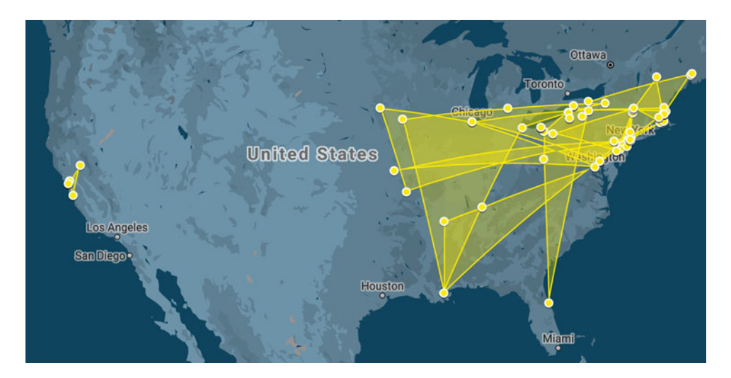
Figure 1. Intercity circuits of the American Postal Microscopical Club, 1876. Map data: Google, INEGI.

Only one year after its foundation, the club consisted of twenty-four circuits, then counting six members each, who received one or two boxes of slides per month (Figure 1). As stated in the club's report of 1876, it took 'two years for a slide to make the entire round, and in doing this it must travel not less than thirty thousand miles by mail'.<sup>28</sup> The number of circuits seems to have remained relatively stable over the following fifteen years.<sup>29</sup> The officers of the club were careful only to admit members if there were vacant spots available in existing circuits, or if the new members could form a circuit of their own.<sup>30</sup> Members were expected to contribute at least one slide per year, 'preferably one illustrating some new method of preparation, or result of study'.<sup>31</sup> Slides had to be numbered corresponding to the owner's position in the circuit, so they could easily be attributed to them. From the outset, women could join, yet there were no female microscopists in the circuits established by 1876.<sup>32</sup>