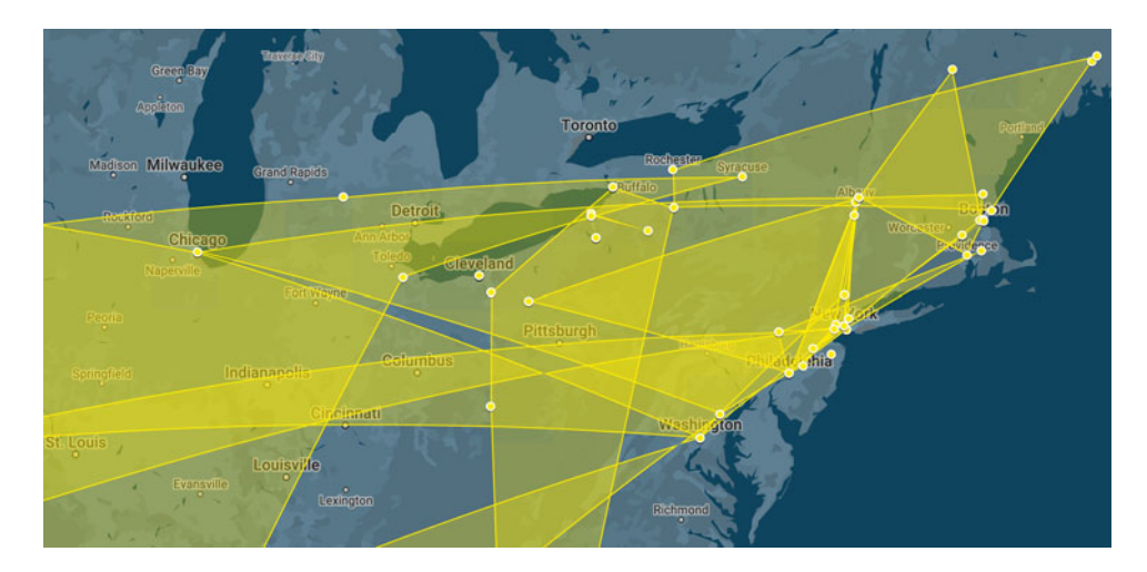
Figure 2. Close-up of intercity circuits in the Northeast, 1876.

time a wealthy industrial city and home to Rensselaer, became the central node in the postal network. Five of the club's circuits passed through Troy, more than through any other city (Figure 2).