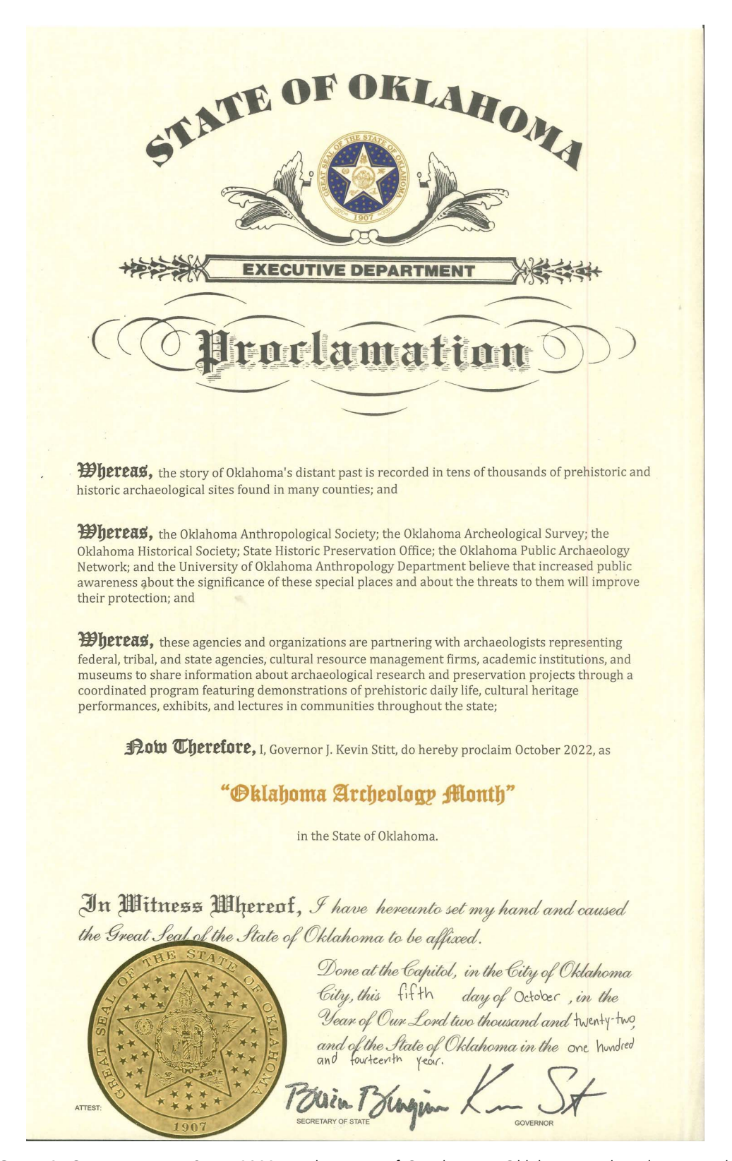
FIGURE 3. Governor Kevin Stitt's 2022 proclamation of October as "Oklahoma Archaeology Month."