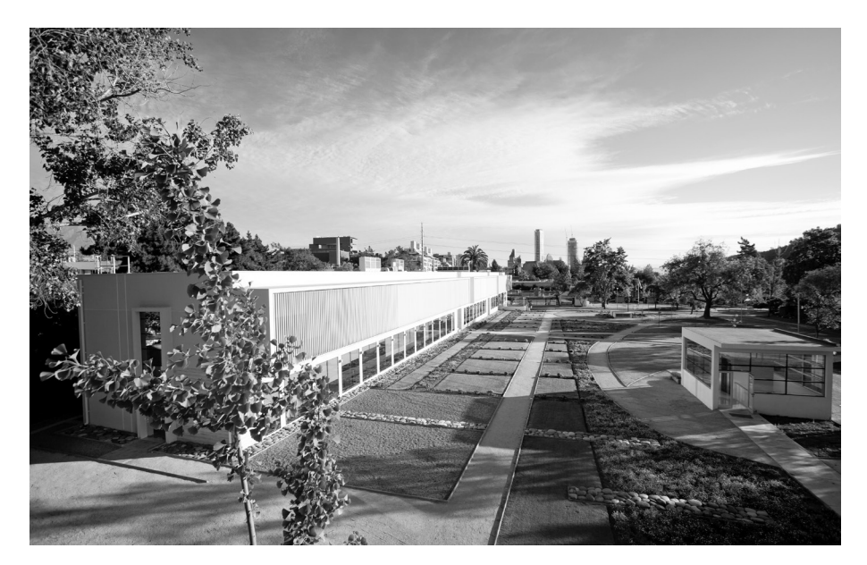
Figure 7.5 A view from the north of the SCO (ALMA Headquarters) on the ESO compound in Vitacura, Santiago. The lawn separates SCO from the ESO building, out of the image to the right. The small building to the right leads to an underground parking garage between the two buildings.