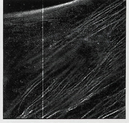
Figure 3: Column defect