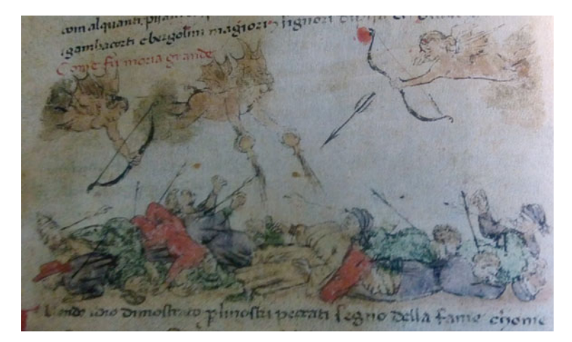
Figure 1. Lucca, Archivio di Stato, MS 107, fol. 49<sup>v</sup>: Come fu moria grande .

time of the Bianchi') began in Genoa in 1397, striking central Italy in late 1399, where it reached a peak in the summer of 1400.<sup>22</sup> The Tuscan devotions therefore began before the advent of the plague in that region, although under the shadow of the plague in the north. Sercambi places the initial outbreak in Lucca in September 1399, about a month after the Bianchi devotions began in the town, but still during the height of the processions.<sup>23</sup> He has a second entry for the disease in May 1400, indicating that a hundred and fifty people were dying each day.<sup>24</sup> The Podestà led a plague procession in 1400, a completely separate event from the Bianchi processions the previous year. Council records show significant numbers of deaths, and emergency measures were implemented.<sup>25</sup>