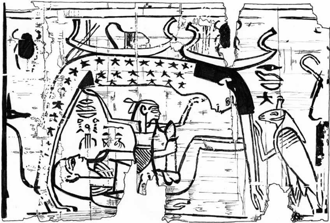
Figure 2.1 Detail from the Book of the Dead of Sesu . This fragmentary papyrus roll, excavated from a tomb in Thebes (modern Luxor) in Egypt, contains a richly illustrated collection of spells designed to enable Sesu to navigate the afterlife. Nut (Sky) arches over Geb (Earth). Roll 20.5 cm high: British Museum, EA 9941.1. Drawing by Paul C. Butler, used with kind permission.

underworld, where his ithyphallic rendering represents his resurrection. The erect penis is a sign not only of life, but specifically of new life. 10