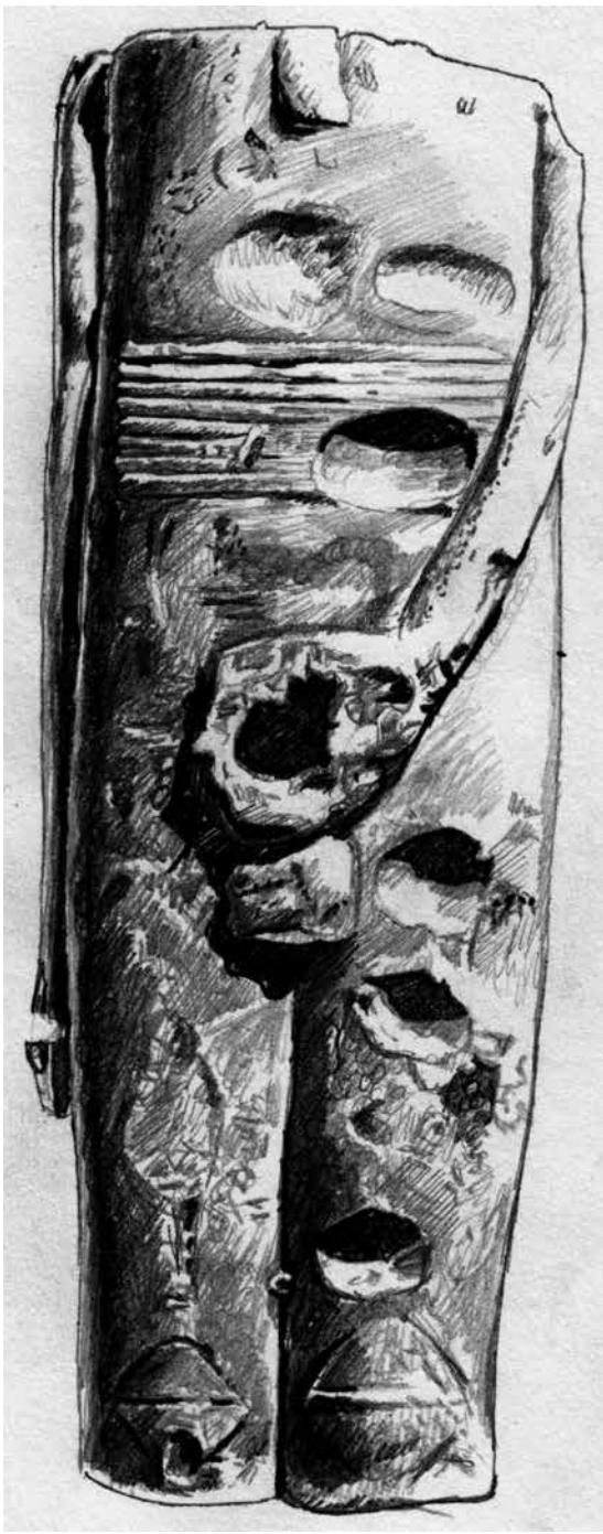
Figure 2.2 Surviving segment of one of three colossal limestone statues of the god Min excavated from his key temple site at Coptos (modern Qift) in Egypt. Dating from around 3300 BC, the whole statue would have stood about 4 m tall. Ashmolean Museum, AN 1894.105e. Drawing by Paul C. Butler, used with kind permission.