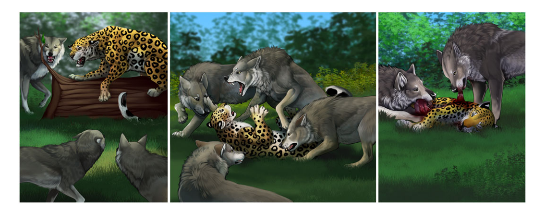
Figure 3 Scenes showing conflict between the leopard Panthera pardus with one of his main competitors during the Late Pleistocene, cave wolves Canis lupus spelaeus near the Radochowska Cave. (Drawing by W. Gornig.)

confrontation of a solitary cat with a pack of wolves is a different story (Figure 3). In this regard, we agree with the hypothesis proposed by Spassov and Raychev (1997) that a set of different factors caused the species not to form vital populations after the LGM (GS-2.1a interval, 17.5–14.7 kyr), when intensive deglaciation processes started. Among them, there are a lack of sufficient food sources combined with a relatively small number of adequate rocky shelters, the high density of the wolf population, and intense human pressure. Isolated, relict populations such as those in the Iberian Peninsula, which survived without probable contact with the North African populations, were probably exterminated by humans at a fairly early date. Eastern re-colonization, in turn, was probably hindered or even prevented by a strip of wide, almost treeless plains that effectively cut off central and western Europe from the eastern populations of P. pardus , where the leopard has survived (Bartosiewicz 2001).