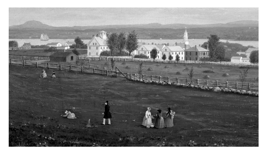
FIGURE 2.2 Fitz Henry Lane, Castine, Maine (1856), detail. Oil on canvas, 53.66 × 85.09 cm (21 1/8 × 33 1/2 in.). Museum of Fine Arts, Boston. Bequest of Maxim Karolik, 64.437.

of colonialism, and perhaps no group on the planet has escaped its ever-widening impact. Voluntary and coerced migration combine along a broad spectrum, and mixed mobilities flourished with extraordinary intensity in the Wabanaki homeland starting in the 1750s. A comparative perspective on forced migrations in this region highlights that refugees were far from unique or exceptional. Rather, they were quotidian figures whose movements and actions helped to create the modern world, and who remain a familiar presence in a world distressed by war, economic inequality, and climate change.