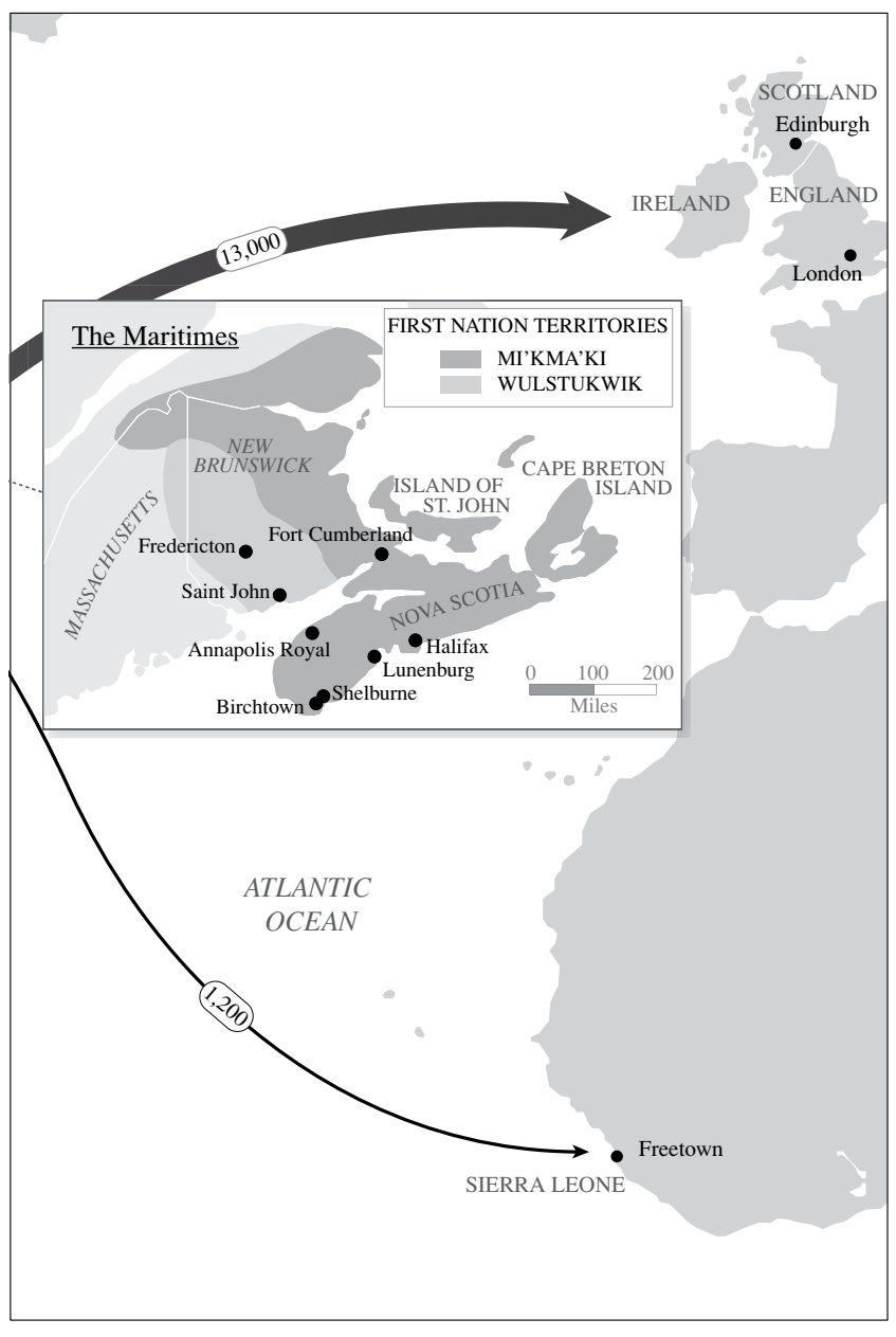
MAP 2.1 (Continued)