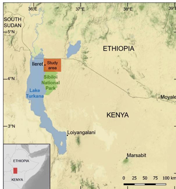
FIG. 1 Location of the study area in north Kenya, adjacent to Sibiloi National Park.

Here, we bring into focus the existence of a biocultural conflict in a traditional coming-of-age ceremony, the Dimi