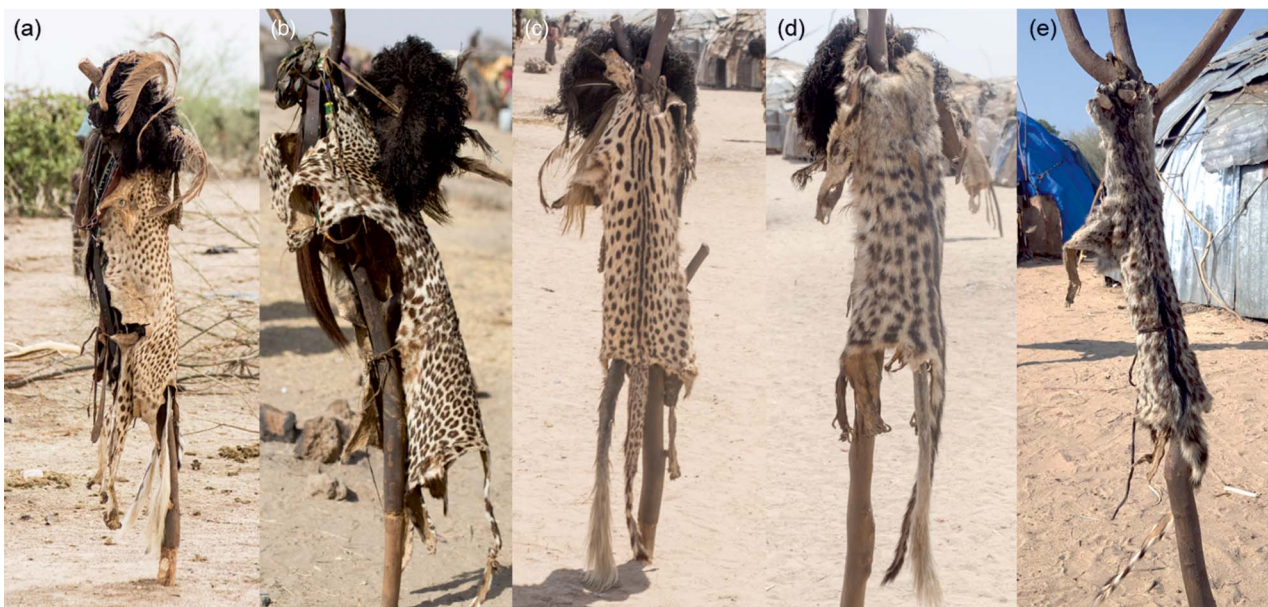
PLATE 2 Skins of species used in Dimi ceremonies: (a) cheetah Acinonyx jubatus , (b) leopard Panthera pardus , (c) serval Leptailurus serval , (d) African civet Civettictis civetta , and (e) common genet Genetta genetta , with ostrich Struthio molybdophanes feather headdresses (a–d).

common genet Genetta genetta and serval Leptailurus serval (Table 1, Plate 2c–e). Most (83%) of the cheetah and leopard skins were old, whereas most (64%) of the civet, genet and serval skins were fresh (Table 1).