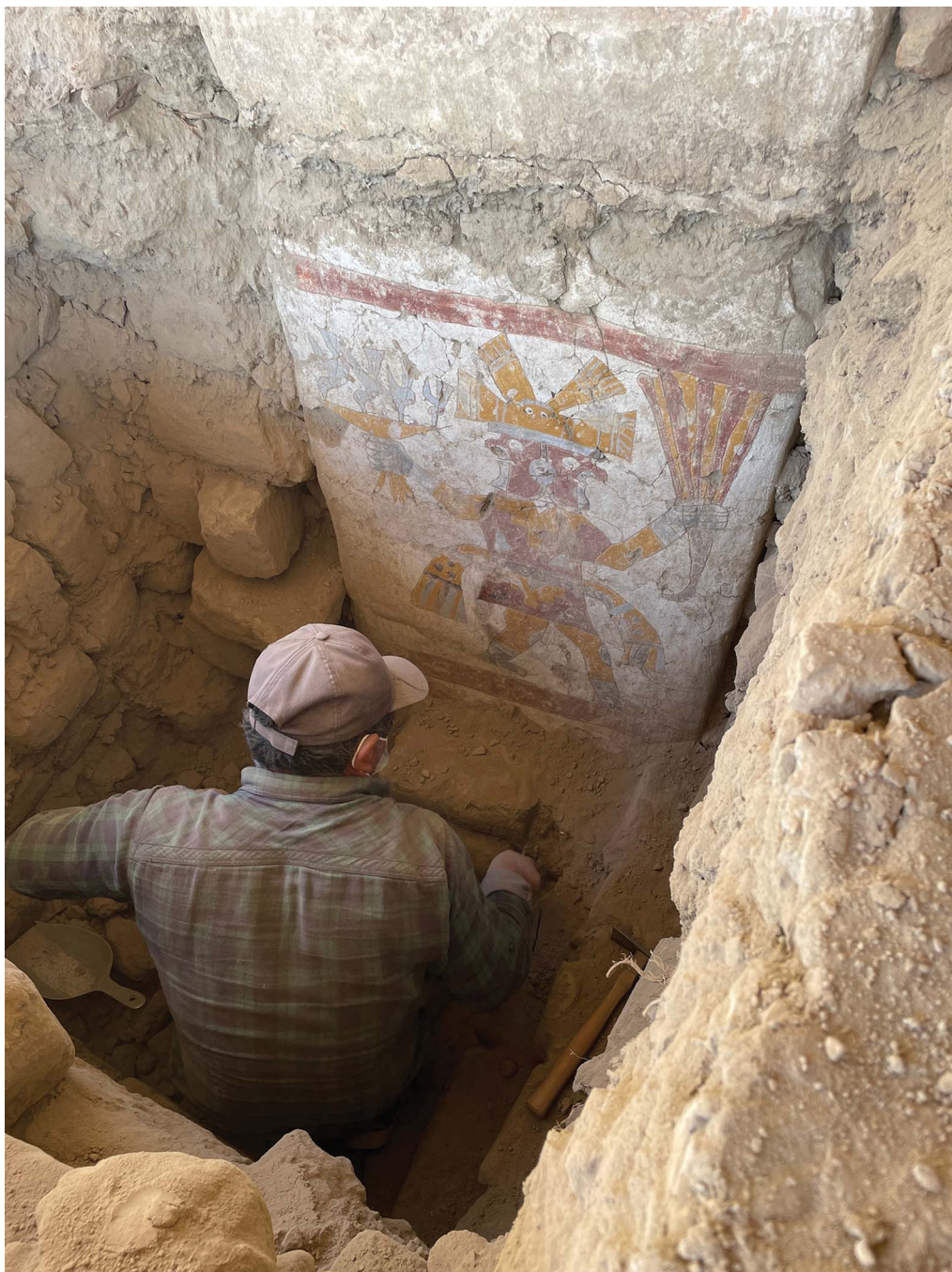
Frontispiece 1. Excavation during 2022 of a painted adobe pillar at Pañamarca, in Peru's coastal Ancash region. The mud-brick architectural complex at Pañamarca, located on a rocky outcrop in the lower Nepeña Valley, dates to between AD 550 and 800 and lies in the far south of the Moche world. Current work at the site commenced in 2018, with the aim of documenting the long-term occupation of the site. The 2022 season concentrated on obtaining stratigraphic evidence and building sequences within the monumental area, and the documentation and conservation of painted murals. The presence of locally made pottery and goods imported from the highlands to the east, including textiles and feathers, provides evidence for production and long-distance exchange.