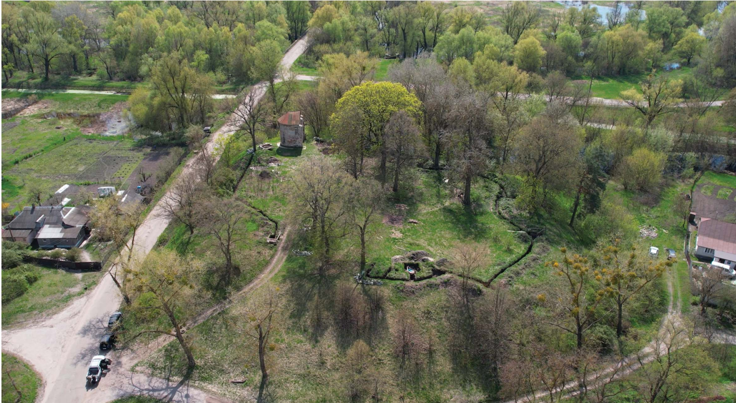
Frontispiece 2. Aerial photograph of Каплиця Святого Юра (St George Chapel), citadel, and previously unrecorded graveyard from the twelfth century AD, at Oster, Chernihiv Oblast, Ukraine, April 2023. The standing remains of the twelfth-century brick church are in the background, with infantry defensive trenches along the edge of the mound. These were constructed in March 2022 during the Russian invasion of Ukraine. On-going photogrammetry and field research demonstrates that the 200m of military entrenchments at Oster have destroyed parts of the citadel, the church and extensive early medieval graves. This research is part of a wider international collaborative project between the Archaeological Landscape Monitoring Group, National Taras Shevchenko University of Kyiv, Ukraine, the Institute of Archaeology, the National Academy of Sciences, Ukraine, and the University of Notre Dame, USA.