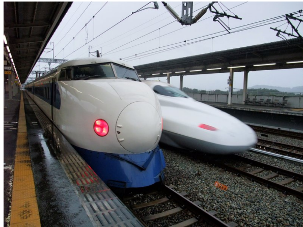
Shinkansen 0 series with Nozomi passing. Photo Wikipedia Commons.