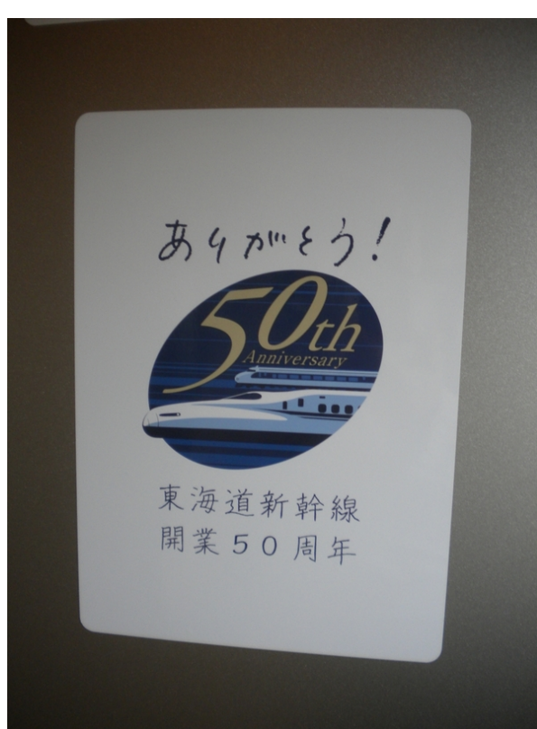
Modest 50 th anniversary: small stickers in shinkansen cars in 2014.

We take for granted that governments should be involved in taking care of security and improving the conditions for economic development. Both of these goals require adequate investment in basic infrastructures that will provide decades-long benefits: in North America there is little argument that highways belong to this category: just consider the continuing economic, social and security benefits of the U.S. interstate system launched under Eisenhower and built with federal financing. This does not mean that there should be an indiscriminate preference for rapid trains. After all, it must be acknowledged that Japan has the uncommon advantage of concentrated population (with daily passenger density per km of rail route almost six times higher than it is in France, and in the region served by Tōkaidō shinkansen about five times the Japanese national mean) that makes it