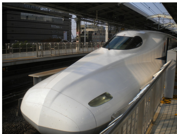
Nozomi 700 Series in November 2014.

These safety measures have made it possible to raise routine operating speeds and to cut travel times. The first trains traveling from Tōkyō at no more than 210 km/h took four hour to reach Ōsaka; just a year later the trip was down to three hours and ten minutes, and in 1992 new Nozomi trains (travelling at the maximum of 270 km/h) reduced the travel time between the capital and Ōsaka to just two hours and 30 minutes; a further 5 minutes was shaved by the latest Nozomi version (N700). But these times do not reflect maximum possible speeds, because the fastest trains must reduce speed in many sections in order to minimize noise where the line transects inhabited areas.