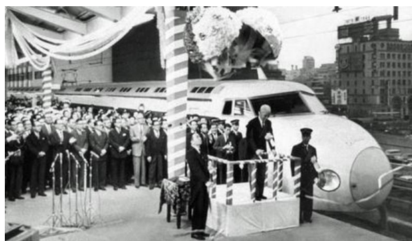
Tōkaidō shinkansen launched at Tokyo Station, 1964

route between Edo and Kyōto, the other one (new trunk line) was to distinguish the link, the country's first with standard gauge (1,435 mm) from the old narrow-gauge (1,067 mm) railways built in Japan since the first link between the capital and Yokohama in 1872. 5 As with many other megaprojects, there were some questionable cost estimates, inadequate financing and (what we know now are almost inevitable) cost overruns. In 1958 JNR put the cost at an unrealistically low ¥ 194.8 billion (equal to $ 541 billion in 1958 monies and to at least $4.5 billion in 2014 $) in order to secure the government's funding approval, and the World Bank's eventual loan of just $ 80 million was only about 15% of that grossly underestimated budget. The actual cost reached ¥ 380 billion (just 5% short of doubling the original estimate) and even before the project was completed these large overruns led Sogo Shinji, the President of JNR, and Shima Hideo, the company's VP for engineering, to resign in 1963. But the project was finished on time on October 1, 1964, that is just in time for the Tōkyō Olympics, after five years and five months of construction.