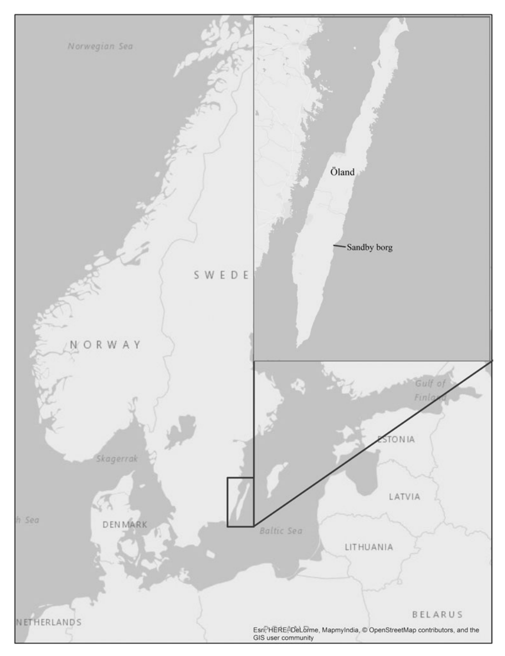
Figure 1. Scandinavia, with Öland and Sandby borg indicated. (Basemap © OpenStreetMap contributors, modified by Helena Victor.)

the early and middle Iron Age (Table 1), several ringforts were erected on the island; the remains of 16 are still visible today (Wegraeus 1976). Several Öland ringforts, Sandby borg included, were seemingly used as fortified villages, with houses enclosed by a high circular limestone wall (Fig. 2; Skarin-Frykman 1967; Stenberger 1933; Wegraeus 1976). There is no consensus regarding whether the ringforts were