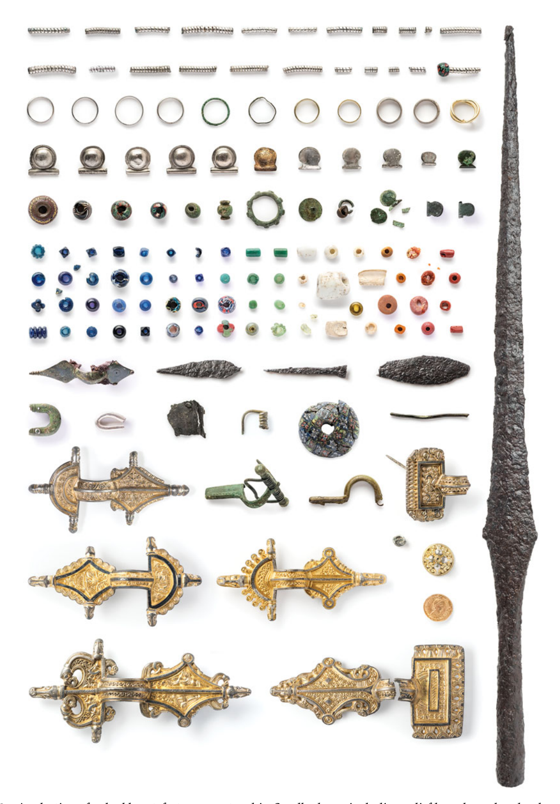
Figure 3. A selection of valuable artefacts encountered in Sandby borg, including relief brooches, glass beads, silver and gold finger rings, solidi and silver pendants.