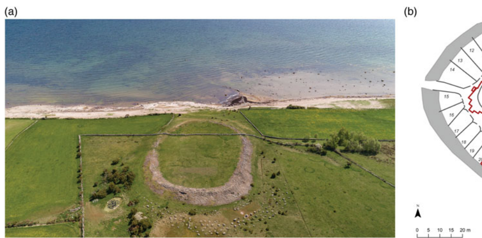
Figure 2. (a) The remains of Sandby borg as visible today. (Photograph: Sebastian Jakobsson); (b) Plan of Sandby borg based on excavations, aerial photographs and geophysical surveys (Viberg 2012). Three complete houses, minor parts of another six houses and sections of the street surrounding the central block have been excavated between 2011 and 2017 (Dutra Leivas & Victor 2011: Gunnarsson et al. 2016; Papmehl-Dufay & Alfsdotter 2016; Victor 2012; 2014; Victor et al. 2013). Excavated areas are indicated (Figure: Helena Victor); (c) During excavations in 2016 house 4 and part of the adjacent street were investigated. The gables of houses 5 and 6 are visible in the left of the picture. Houses 4 and 5 are separated by a narrow alley leading up to a small gate. Human remains were encountered both indoors and outdoors (Photograph: Sebastian Jakobsson).