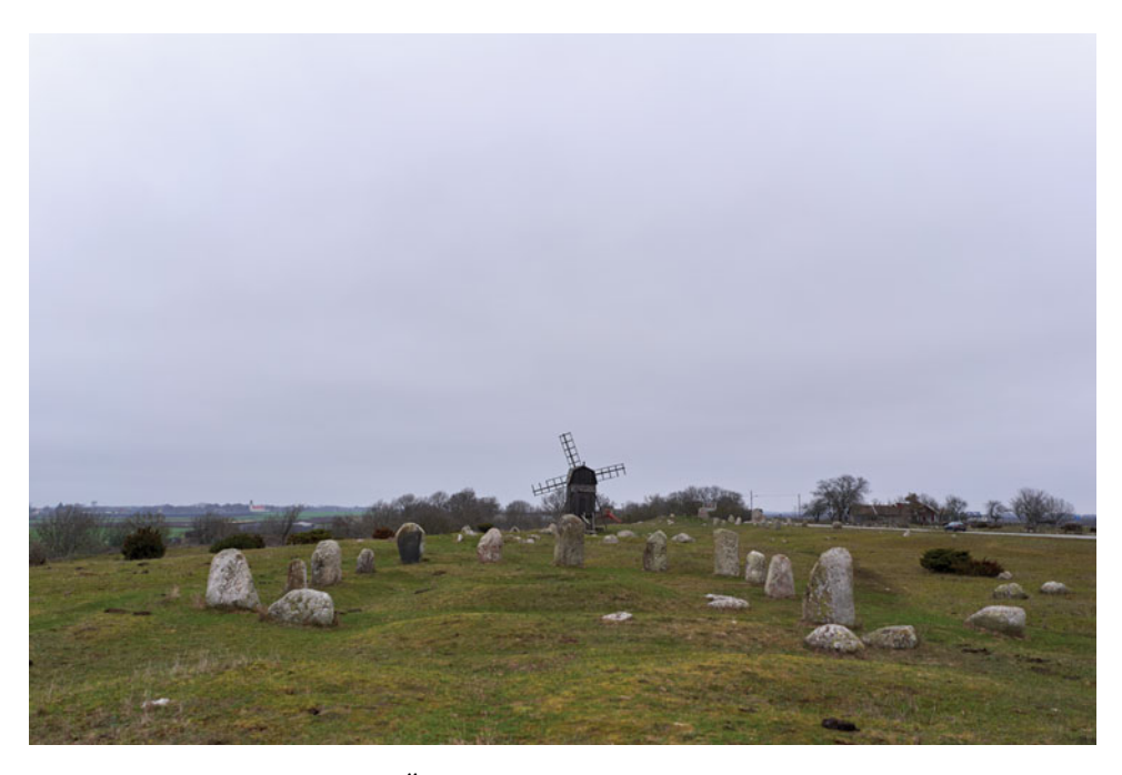
Figure 5. Gettlinge grave field, one of many Öland Iron Age grave fields with standing stones still visible today.