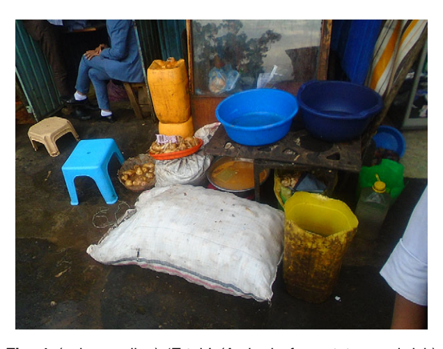
Fig. 1 (colour online) 'Erteb' (Amharic for potato sandwich) (Girl, 15 years PS)

The activity where participants assigned photographs to different themes revealed what they perceived as healthy or unhealthy. Photographs assigned to the 'unhealthy food' theme included mostly fried foods prepared on the roadside, but also included three photographs of fruit and vegetables sold in carts on the road, which were therefore perceived as unclean. However, fruit and vegetables presented in a clean manner as well as packaged foods sold in shops were associated with 'healthy foods'.