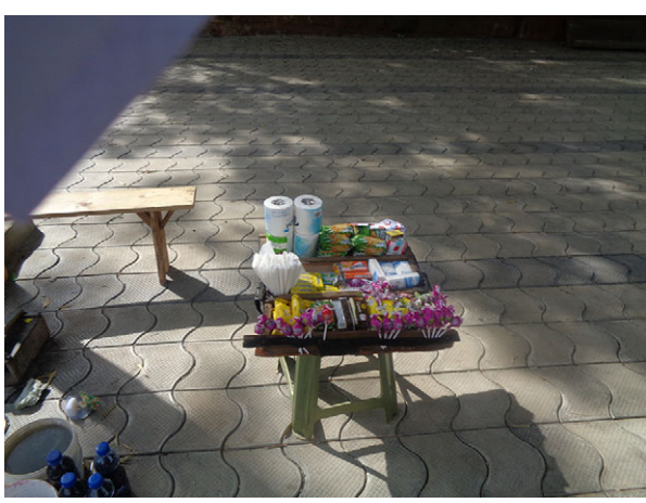
Fig. 4 (colour online) 'Sweet food that we can easily buy' (Boy, 17 years, GS)

There were two main areas where participants expressed the need for the government to intervene. The first was related to food safety and poor hygiene of food outlets.