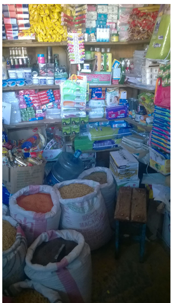
Fig. 3 (colour online) 'The shops supply' (Boy, 17 years, GS)

'You can see the packed food here and you can read their contents and understand what you want to eat.' (Boy 17 years, GS) – Fig. 3