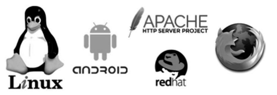
FIGURE 19.9 Major OSS successes include the Linux and Android operating systems, the Apache web server, the Firefox browser and Red Hat, which provides services related to Linux.

could result in the entire program becoming OSS – a potentially catastrophic result for a company in the business of selling proprietary software.