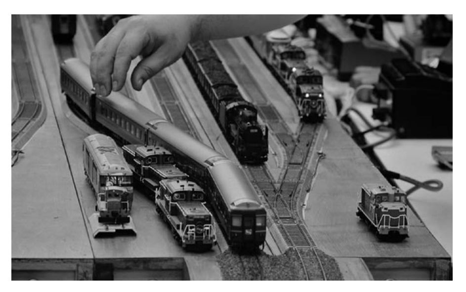
FIGURE 19.8 Jacobsen v. Katzer concerned OSS used to control model trains.

The judgment of the District Court is vacated and the case is remanded for further proceedings consistent with this opinion.