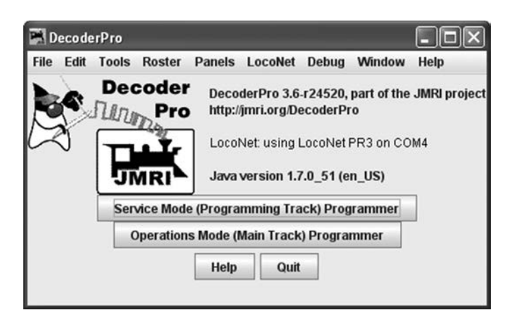
FIGURE 19.7 Screenshot from the DecoderPro model railroad control software released by Jacobsen for the JMRI project.

The downloadable files contain copyright notices and refer the user to a "COPYING" file, which clearly sets forth the terms of the Artistic License.