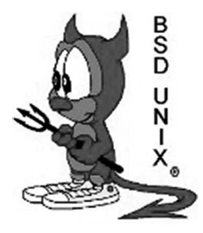
FIGURE 19.4 A "daemon" is a type of software agent. This demon in sneakers came to be associated with the BSD project.

The original BSD license contained four short clauses plus a disclaimer of warranties and limitation of liability. One of those clauses (#3) caused considerable consternation in the industry. It read: