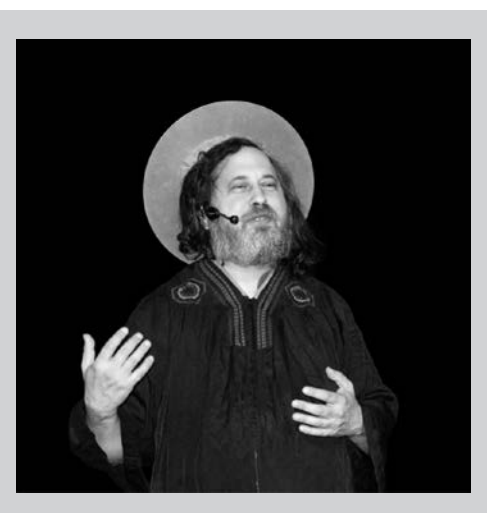
FIGURE 19.2 Richard Stallman, founder of the free software movement, speaking in Oslo as Saint IGNUcius in 2009.

Today each of these kinds of free software business is practiced by a number of corporations. Some distribute free software collections on CD-ROM; others sell support at levels ranging from answering user questions to fixing bugs to adding major new features. We are even beginning to see free software companies based on launching new free software products.