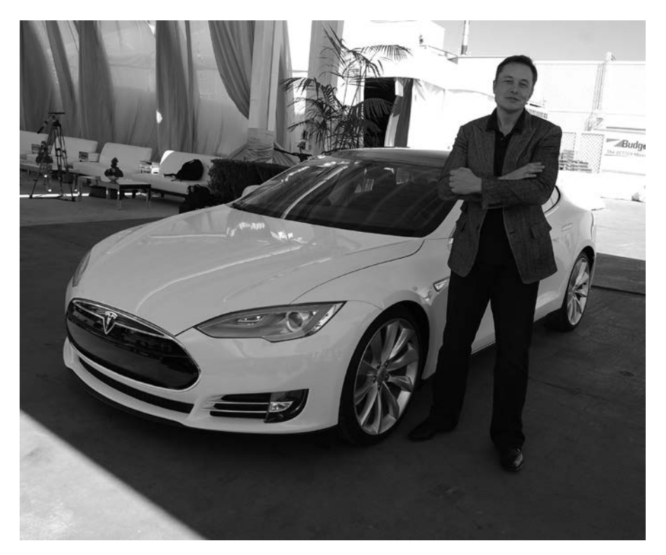
FIGURE 19.10 Elon Musk, the flamboyant CEO of Tesla Motors, pledged all of the company's patents in a 2014 blog post.

At best, the large automakers are producing electric cars with limited range in limited volume. Some produce no zero emission cars at all.