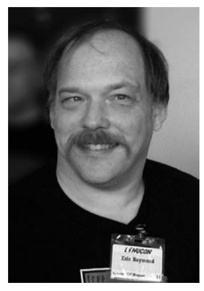
FIGURE 19.3 Eric Raymond, one of the founders of OSI, in 2004.