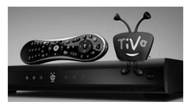
FIGURE 19.6 In 1999 TiVo introduced the first successful mass-market DVR device. It ran the Linux kernel.

the signs of a Frankenstein contractual clause negotiated by committee. In effect, it requires that consumer hardware devices intended for home use (i.e., not equipment used in hospitals, factories, etc.) allow end users to upload modified versions of GPL software, so long as this will not interfere with their operation. It also permits the manufacturer to void warranties and service commitments when modified software is installed.