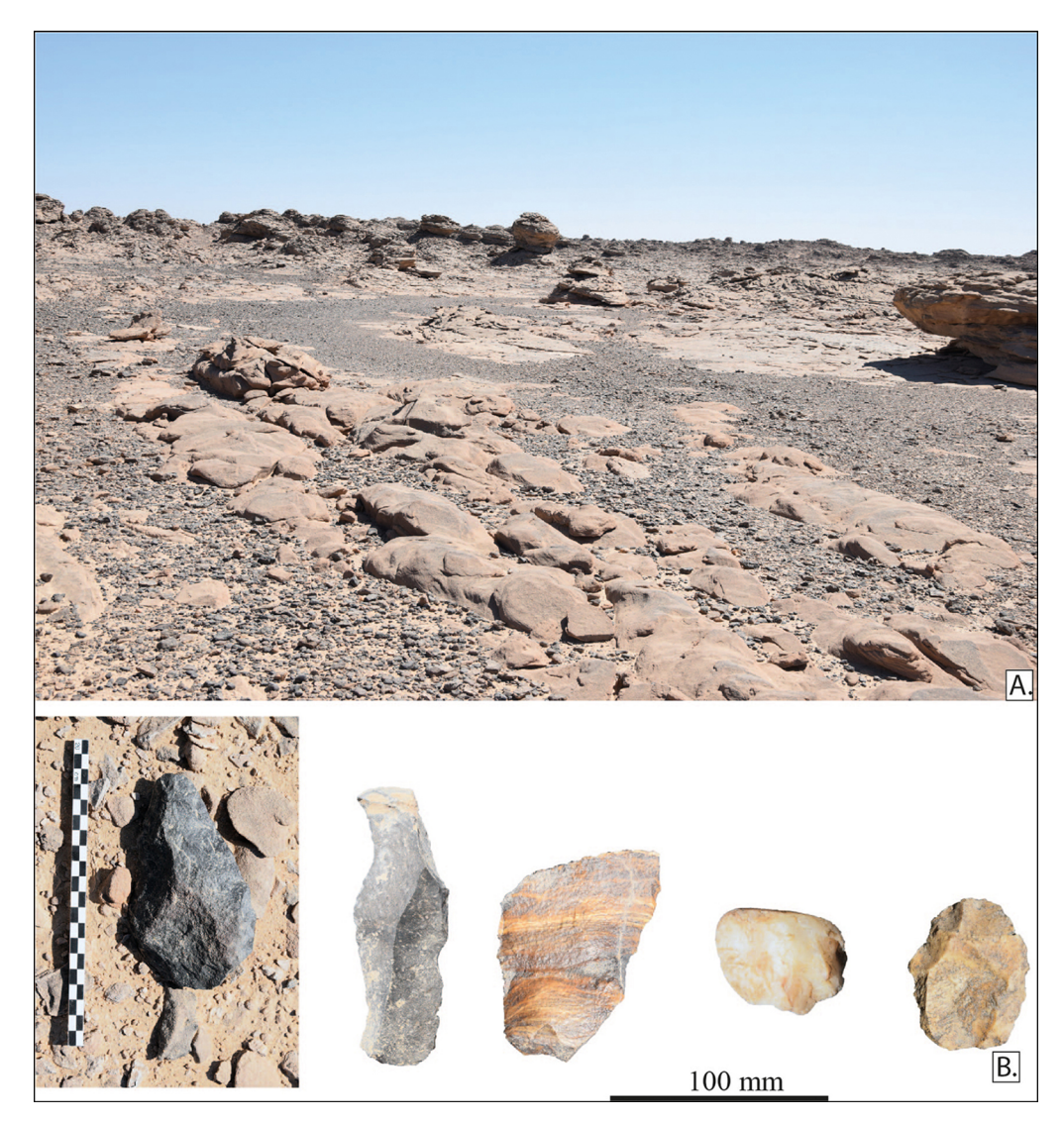
Figure 3. Artefact scatters in deflated context (L613). A) overview of the area; B) from left to right: handaxe, large blade with facetted platform, flake in fossilised wood, quartz core, Levallois core (figure by authors).

artefact scatters represent a palimpsest of repeated occupations of the area over a long time and/or a secondary accumulation of artefacts driven by erosion (flooding and aeolian deflation).