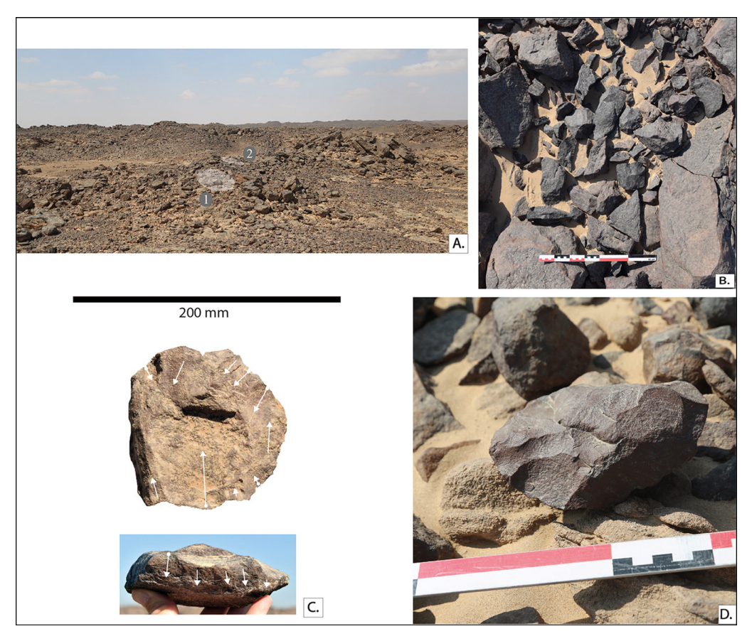
Figure 5. Earlier Stone Age lithic workshop (L602–603). A) overview of the site with the two main concentrations of artefacts; B) detail of area 2; C) large centripetal core; D) handaxe preform (figure by authors).

The workshops likely represent repeated episodes of exploitation of the outcrops over a long timespan but show that different types of sandstones were exploited during the Earlier and Middle Stone Age. Earlier Stone Age workshops are associated with a coarser-grained ferruginous sandstone and Middle Stone Age workshops with finer-grained sandstone, which suggests the need for different raw materials in different periods. The comparison of the geological map of the Nubia Sandstone (Klitzsch et al. 1987) and the distribution of the Stone Age occurrences in Wadi Abu Subeira suggests that Stone Age occurrences are related to exposures of a specific formation, with probable higher-knapping quality: the Timsah Formation. The selective exploitation of localised exposures in the landscape attest to well-developed knowledge of the environment in this part of the desert by humans during the Earlier and the Middle Stone Age.