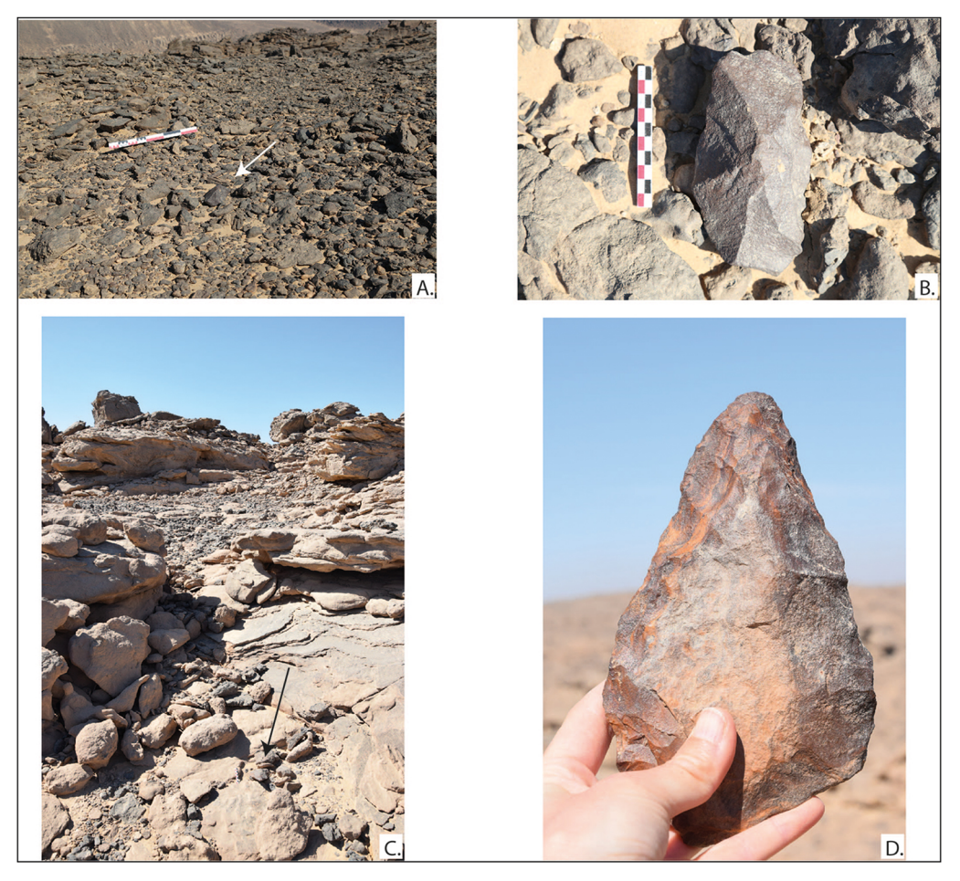
Figure 2. Earlier Stone Age isolated finds: A & B) context and photograph of cleaver L652; C & D) handaxe L672 (figure by authors).

top of the plateaux or on the slope between the plateaux and the wadis. Isolated artefacts include one large symmetrical handaxe and one cleaver made from coarse ferruginous sand-stone (Figure 2). Artefact scatters with no evident spatial patterns include one large example (>500m long, L613, Figure 1) with no clear delimitation between distinct concentrations of artefacts. At this site, artefact density was systematically recorded every 15m along a 300m-long line. Densities vary from 0 to 10 artefacts per square metre. Artefacts are made from various raw materials, including quartz, silicified wood, silicified (ferruginous) sandstone and chert, but there was no primary source for most of these raw materials at the site, with the exception of quartz. However, these raw materials may have been available from the wadi bed or on the nearby plateaux. Artefact types include those typical of the Earlier Stone Age (e.g. large handaxes) as well as the Middle Stone Age (e.g. Levallois core—a stone-knapping technique characteristic of the period; Figure 3B). It is likely that these