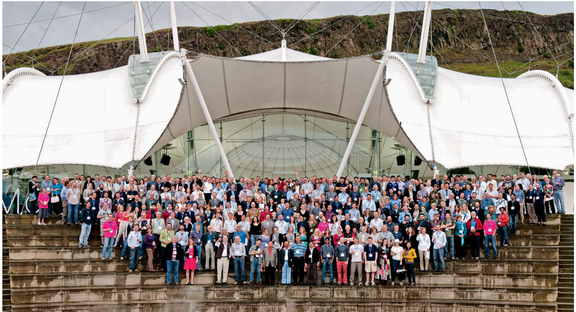
ISAES XI Delegates on the steps of Our Dynamic Earth, Edinburgh, July 2011.