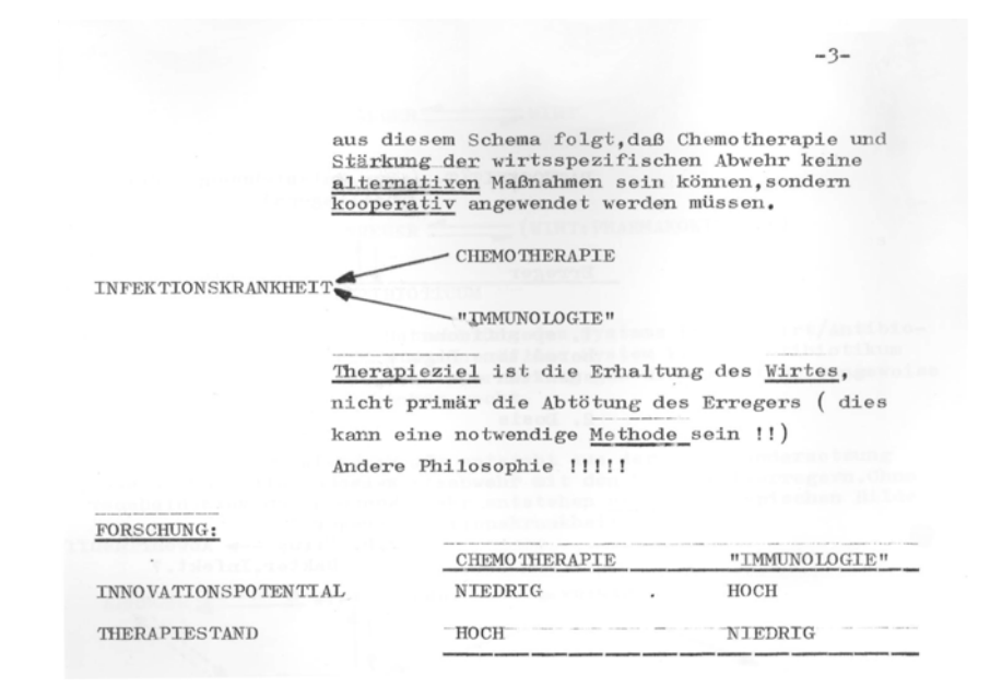
Figure 5: Result of a brainstorming session in 1980. Produced for the workshop 'new approaches in infection control', BAL, 323/150.

Desperation was in the air and in this situation researchers were cautiously trying to think beyond the magic-bullet approach, which they had been following for almost eighty years. So far, their work had built on the assumption that curing infections was all about attacking the responsible pathogen. Held in 1980, a high profile workshop had the revealing title 'new approaches in infection control' and it illustrates the atmosphere of perplexity that was prevalent those days (see figure 5).