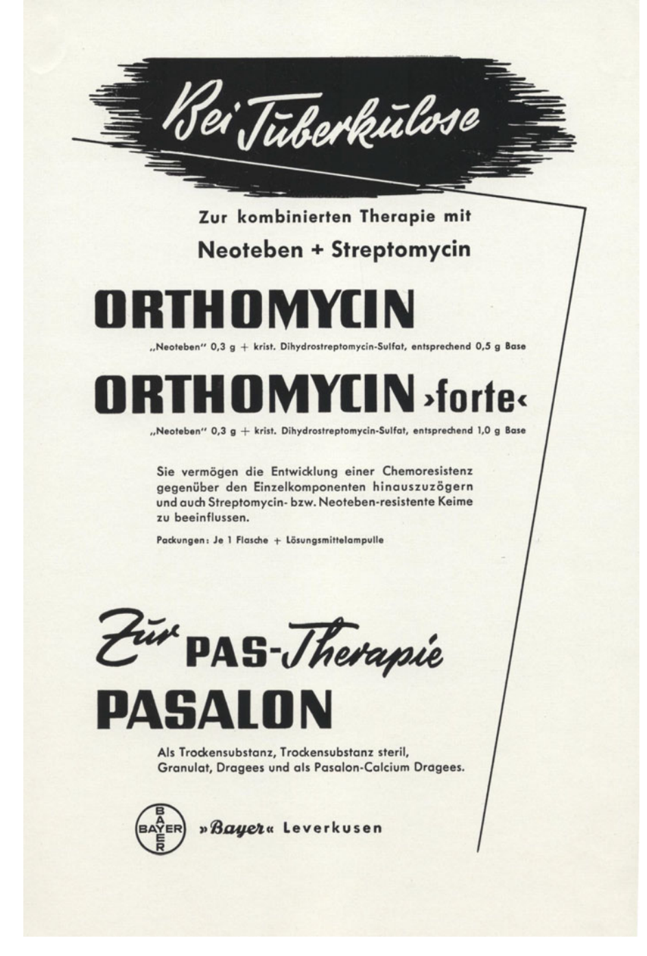
Figure 2: Advertisement for Orthomycin, mid-1950s, BAL, 166/8.