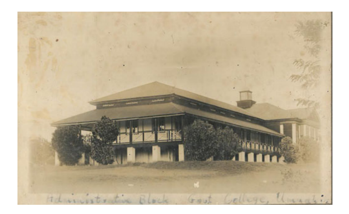
FIGURE 2 The Administrative Block of Government College, Umuahia in 1945.